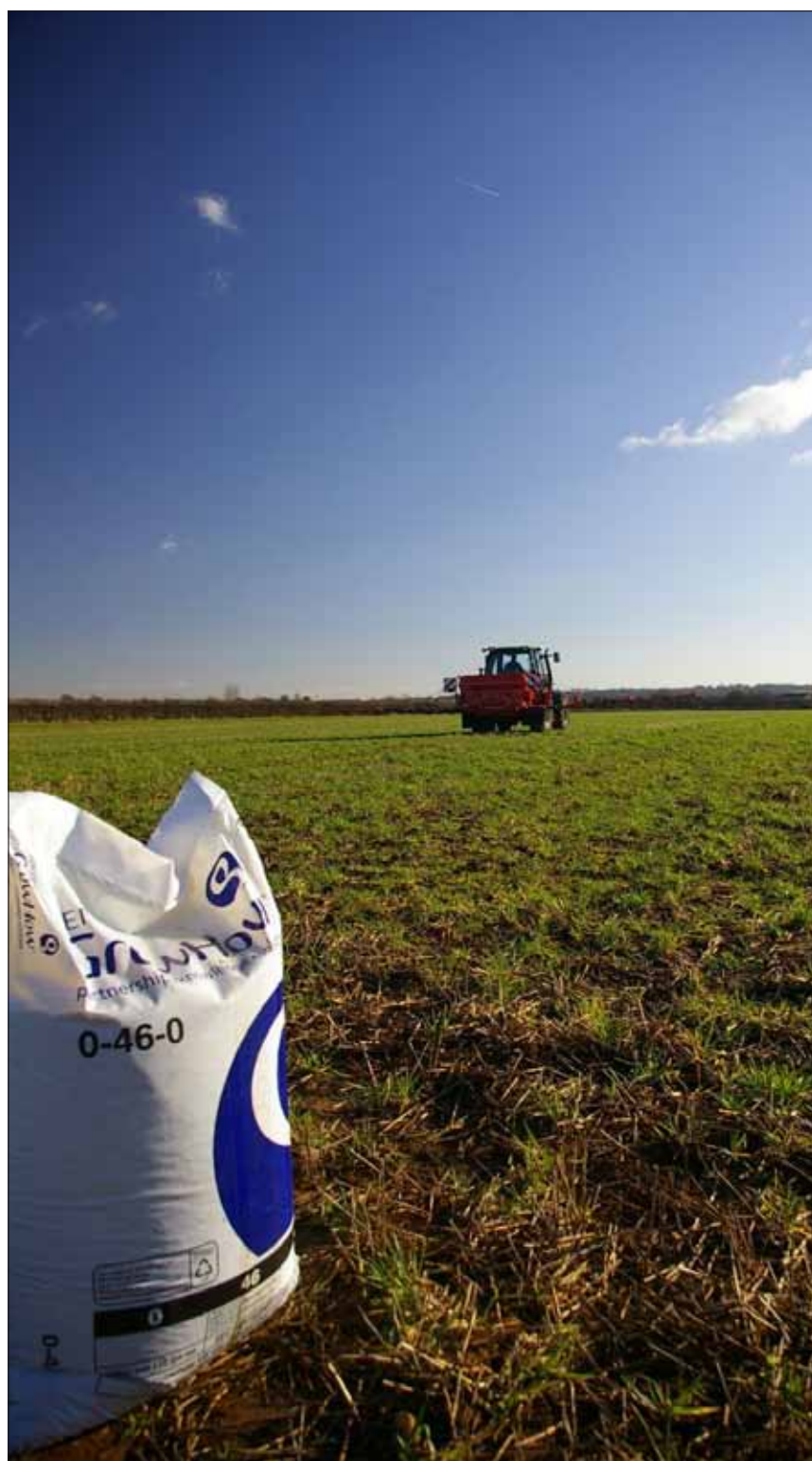
5 Fertiliser costs are increasing each year

It is much harder to quantify the financial gains to be made from other benefits of green manures, such as improvement to soil structure, water holding capacity, increased availability of nutrients (such as phosphorus) or weed management. These benefits may not be seen after individual