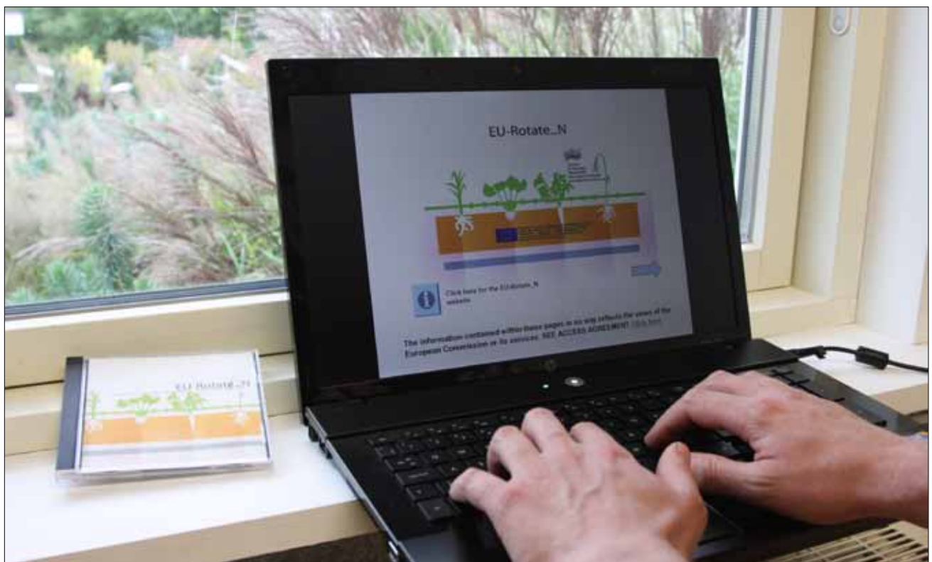
6 Computer models help growers to make more informed decisions on the financial benefits of green manures

It is normal to run models with historical weather data for a particular site. It is also possible to run simulations with more extreme weather to see the impact that climate change or particularly wet or dry years will have on nutrient availability and crop performance.