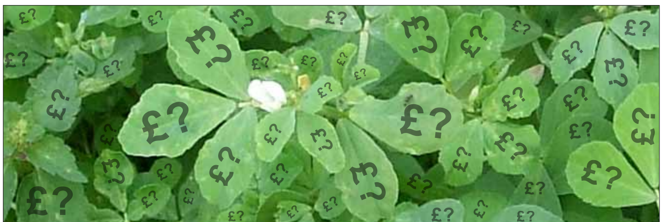
1 Estimating the economic implications of using green manures

This factsheet demonstrates the considerations that need to be made to maximise both economic (Figure 1) and environmental benefits.