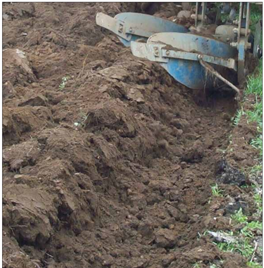
3 A green manure being incorporated into the soil

and topping once, would be about £60 per hectare. The additional cost