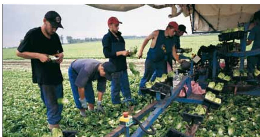
4 Staff busy harvesting a cash crop

An additional cost arises when a green manure is grown as a replacement for a cash crop. This does not apply in every case. For instance, winter green manures are grown when the land in vegetable rotations is often otherwise bare. There may, however, be constraints on sowing and incorporation dates. It can be difficult to find the time to sow a winter green manure in the autumn when staff are busy harvesting a cash crop (Figure 4). Early incorporation may also be necessary where stone removal operations are required. This can result in a green manure being destroyed before it has achieved its full potential. Longer term green manures (e.g. clover leys) will occupy the land for a year or more and may