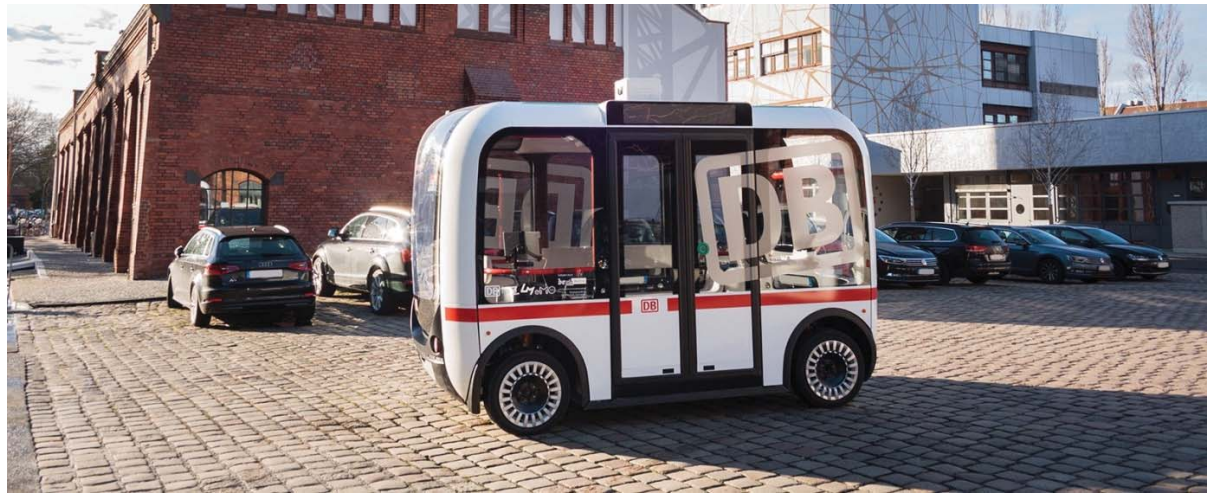
Figure 1. Automated shuttle Olli by Local Motors at the EUREF campus in Berlin-Schöneberg

90 minutes in total. The invitation letter also informed the respondents that the interview would be audio-recorded and that personal data would be treated anonymously. On the day of the interview, the respondents were asked whether they agreed with the conditions stated in the invitation letter and provided their verbal consent. They were offered no financial compensation for participation in the ride and interview.