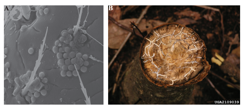
Figure 2. Examples of interactions between forest insects and fungi A detail of the abdomen of the ambrosia beetle Xyleborinus saxesenii (Ratzeburg, 1837) from below with fungal spores B mycelium filling the galleries of the ambrosia beetle Xyleborus glabratus (Eichhoff, 1877).

Symbiosis between trees and mycorrhizae can modify tree physiology and treeinsect interactions (Koricheva et al. 2009), with effects depending on the feeding guild