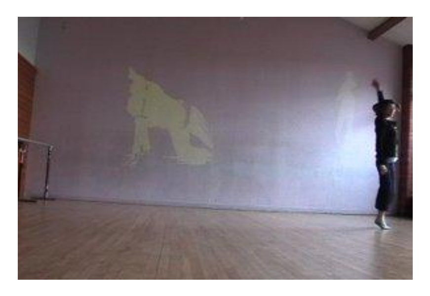
Figure 2 - Choreographer with triptych projections (video still)