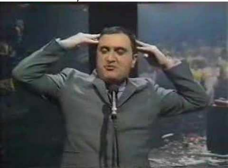
Figure 3 Alexei Sayle on OTT, January 1981