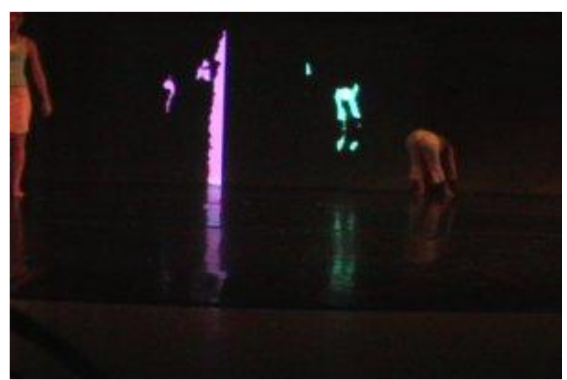
Figure 3 - Performer out of the frame of the camera and lighting disrupting projection (video still)

In addition to the issues in the performance with the physical space, the performers' relationship to the camera space contained many problematic elements. Within the author's previous work, the creator and the performer were the same, therefore an awareness of the camera placement and camera space was understood, such as the limits in the physical space where the performer can dance and be seen by the camera. Being seen by the camera in turn produces the visuals within the projection space. Although there was a full week of rehearsals with the camera system, the rehearsals were never in the actual performance space, which changes the limitations of the physical space, the placement of the camera, and what the camera space is.