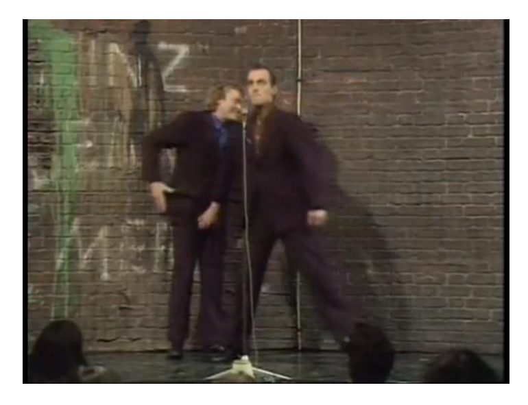
Figure 5 The Dangerous Brothers circa 1981

I have chosen Mayall and Edmondson's knockabout double act The Dangerous Brothers (Figs. 5 and 6) as the second exemplar because they are atypical of the popular memory of alt-com as an aggressively political form of comedy-cabaret. Nonetheless, the Brothers' routines appropriated the punk characteristics of rudeness, frequent swearing, anger and confrontational physicality. This attitude makes them the negation of spectacular double acts like Cannon and Ball and Little and Large. The traditional dynamic of such double acts rests is supplied by the tension between the