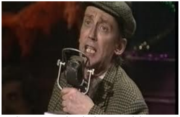
Figure 1 Colin Crompton, The Wheeltappers and Shunters Social Club

A revealing feature of social club comedy was the presentational style of the performer. This applies to the choice of stage wear as well as the often aloof-but-amiable 'bloke-in-the pub' persona, whose delivery of the jokes resembles that of the production line; all of jokes formed in the same fashion: set up, gag and punchline. In the social clubs, the comedian would dress in a suit, often with a bow tie and frilly shirt. This is a sartorial device that is intended to lend the performer a slight air of superiority; it is indicative of the power relationship between the comic and the audience. The suited comedian stands before the audience as a figure of humorous authority yet, at the same time, he appears as their best friend. However his sartorial choice distinguishes him from the common man in the audience, whose best clothes probably consist of a 'demob' suit or something 'off-the-peg' from Burtons.