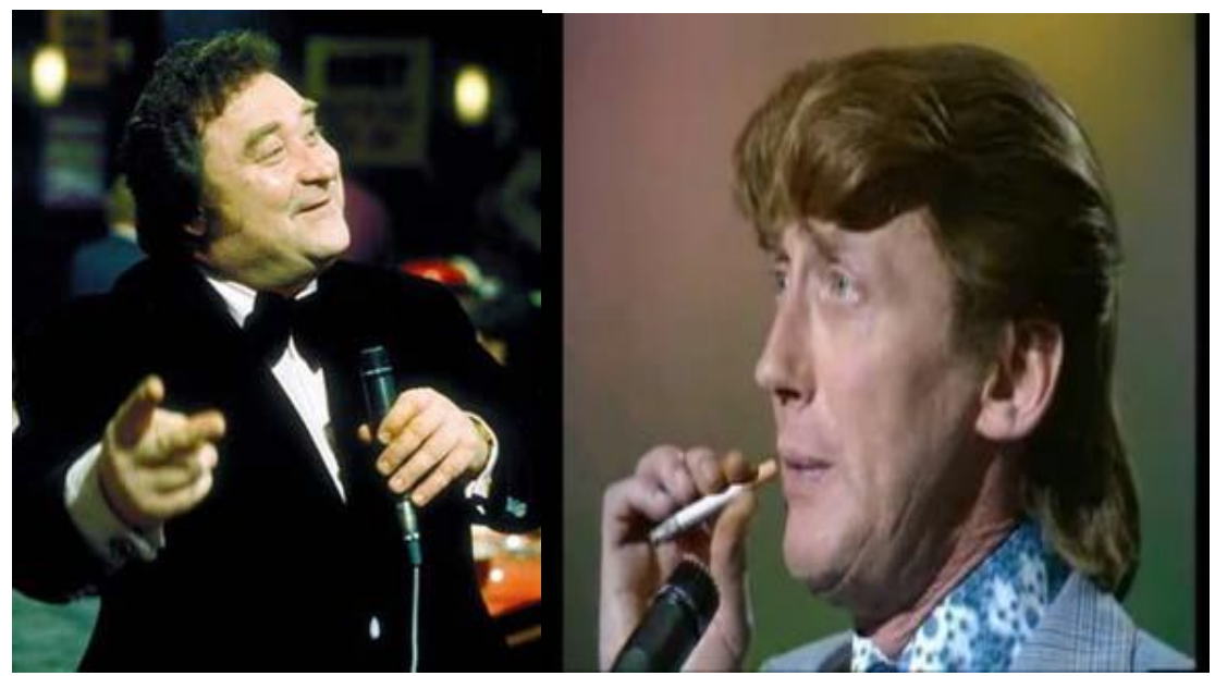
Figure 2 (right) Colin Crompton on The Comedians