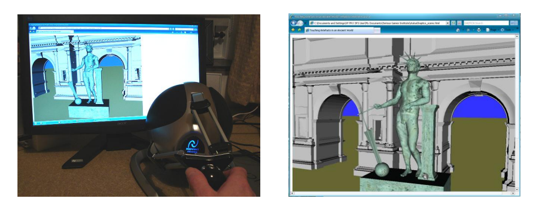
Figure 3. Ancient Rome on a haptic-enabled web browser with a Novint Falcon device