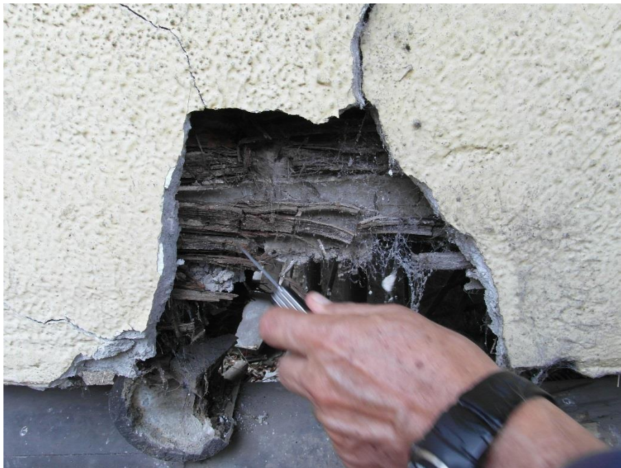
Figure 6: Recommendations for detailing bamboo structures to protect against rot and insects (based on good practice timber detailing, Kaminski (2013) 7 and Trujillo et al. (2013) 8 )