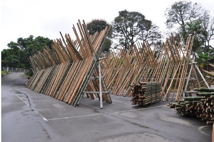
Figure 11: Seasoning of bamboo in Colombia 15