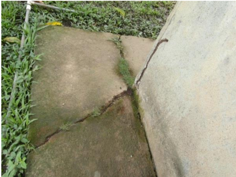
Figure 4: Subterranean termite shelter tube emerging from crack 3