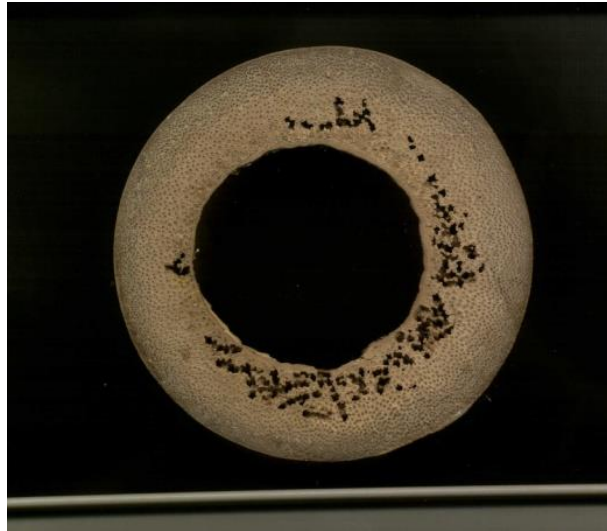
Figure 3: Cross-section through termite-damaged bamboo 5