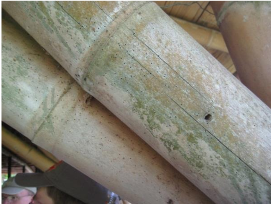
Figure 1: Beetle damage in bamboo – exit holes are clearly visible 3

can be attacked in warm humid climates where the equilibrium moisture content of the bamboo outside (but under cover) will often be higher than in more temperate climates 2 .