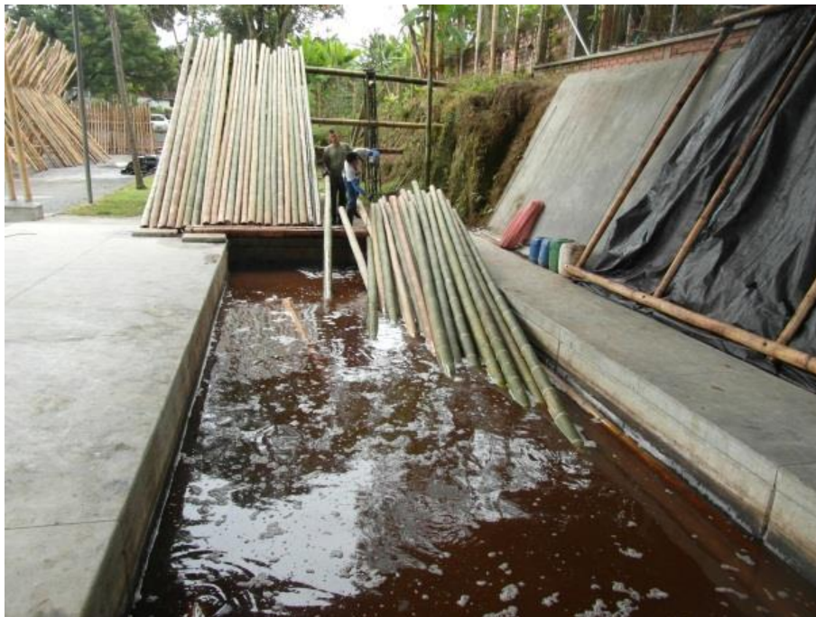
Figure 8: Bath method with boron, Colombia 3

This method involves soaking the bamboo in a bath of the chemical 10 (Figure 8). Split bamboo may require only a week, whereas round culms need 10–14 days. The nodal diaphragm needs to be punctured to allow the chemical to access the inside of the internodes; the chemical can be heated to speed up the process. This requires fresh or almost fresh culms (up to seven days since harvesting) otherwise the cell walls will start to close. Bamboo should be stored upright for a minimum of one week after treatment to allow the boron to diffuse throughout the culm, followed by a further period of one to two weeks to partly season the bamboo. The bath liquid can be reused multiple times. Bath treatment is the cheapest and simplest of the boron treatment methods, but it takes the most time.