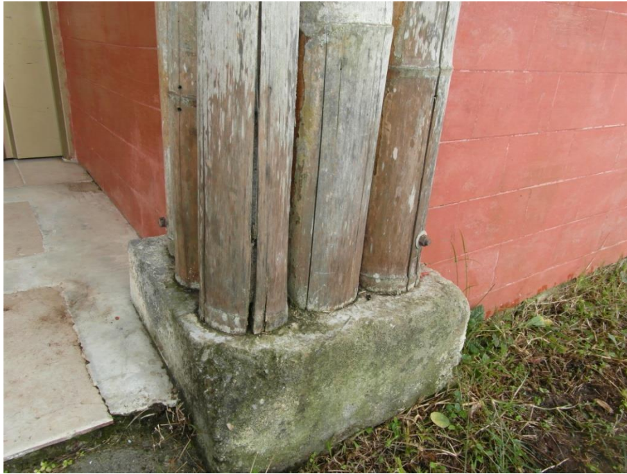
Figure 5: Fungal damage, splitting and bleaching of boron-treated bamboo exposed to the sun and rain after around 10 years 3