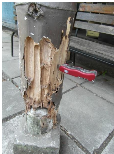
Figure 2: Severe termite damage in bamboo 3

Termites are small ant-like insects which live in colonies and feed on plant material. They are also attracted to the starch in bamboo but unlike beetle have enzymes which also enable them to break down the cellulose. Because they live in large colonies they can cause rapid damage (Figure 2 and 3). There are two generic types of termites: subterranean and drywood. The former live in the (preferably damp) ground whereas the latter make their nests in the timber itself. Subterranean termites are translucent so build tunnels or find hidden paths to avoid sunlight 4 (Figure 4).