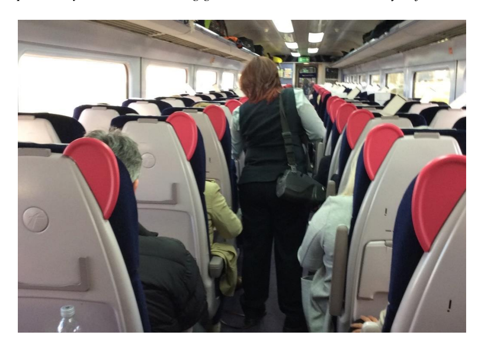
Figure 3 - TM checking tickets on a full coach

With the train moving, the crew member is happy to help and chat with passengers with diverse activities such as giving information, locating coaches and seats and placing luggage on the overhead racks. During the shadowing study, one TM was seen offering a first-class seat and fetching tea for a passenger in need of extra care. TM7 reported giving similar attention during the interview: " I had a passenger on a journey the other day who was just out of the hospital, and she was very pale, so I made sure she was looked after, she had water, something sweet, I kept attending her to make sure she was OK ". CH2 illustrates how the customer care activity can be rewarding in itself: " that's nice when someone had some really shitty day and really everything is going against, and you can sort the problem, you can do something good, that's nice as well, makes you feel nice ".