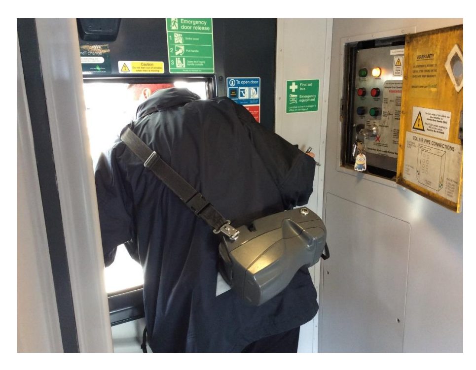
Figure 2 - Train manager checking the platform during departure, on an HST class 43

By the time of departure, the TM is on board the train by the door, checking for last minute passengers intending to catch that train, and ready to dispatch the train (Figure 2). This can be a very stressful situation especially in busy stations and at rush hour, with passengers running down the