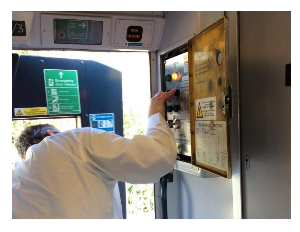
Figure 7 – TM signalling to the driver and opening the door

On the approach to each calling station, the TM has to perform the door procedure (Figure 7) consisting of approximately 20 steps, including announcement, communication with the train conductor via the control panel buzzers, unlocking doors, walking down the platform and doing specific hand gestures and whistle signals. This process is even more complicated at stations with short platforms or without platform staff. It can be stressful given its complexity and coupled with the fact that passengers' behaviour can cause delays and raise safety alerts. In addition, the procedure was performed up to 16 times on a single journey [TM10] and varied with train characteristics.