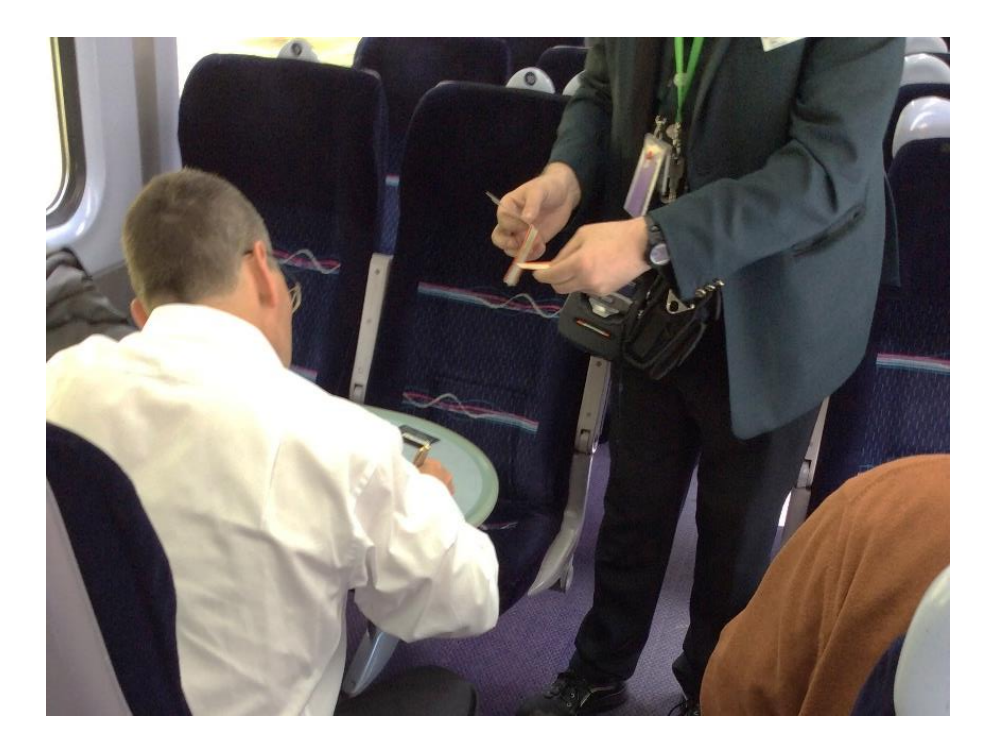
Figure 5 – Passenger signing the sale counterpart

TMs also sell tickets and can earn 5% of their monthly sales, after a £1000 threshold. Some reported gains of £400 on top of their salaries. The possibility of monetary gains makes the process of selling tickets usually positive. However, sometimes it is a time-consuming procedure given that the current machines are not contactless, and that chip and pin devices are sometimes out of order, requiring the swipe and sign method (Figure 5). " We're not even online. We ask them to sign, and check the signature on the back of the card. Now there are just touching cards, contactless, but here we still use to sign. They need to keep up with technology " [CH6].