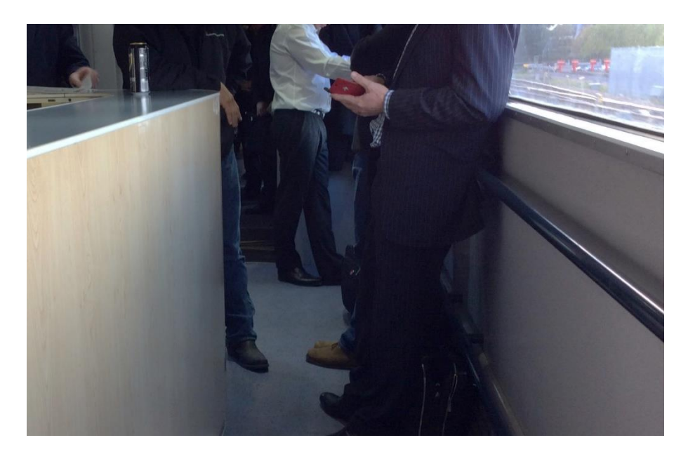
Figure 4 – Crowded service preventing the TM from going through the coaches beyond the buffet car

Checking tickets can sometimes be a negative experience, which TMs would rather not do. The time of the day can affect the dedication to revenue protection, and often they are strategic in order to minimise effort. TM22 described that " in the evening it's harder to validate tickets, passengers are tired and trains are busier ". In some routes, there are specific stops notorious for fare evaders. Dealing with someone who refuses to pay can be a challenging situation, as TM3 exemplifies: " I don't want to get slapped, and I don't want to delay the train. So my hands are tied ". In some occasions, TMs cannot check tickets, such as when the service is crowded with passengers obstructing corridors (Figure 4).