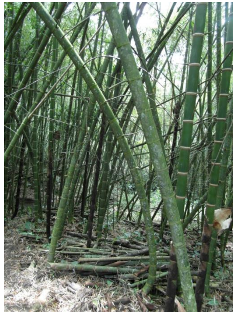
Figure 1: Dendrocalamus asper plantation in Ecuador 5

Worldwide there are around 100 so-called “woody” species suitable for construction. Clumps (a group of culms growing together) of the larger woody species normally reach peak production after about seven years and can maintain regular cropping of around 20-25% throughout their productive lifecycle. Figure 1 shows a bamboo plantation in Ecuador.