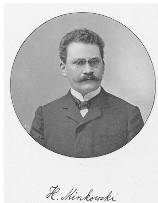
Fig. 3.1: Hermann Minkowski [1864–1909] [43]

” The views of space and time which I wish to develop have sprung from the soil of experimental physics. Therein lies their strength. They have a radical tendency. Henceforth space by itself, and time by itself, will fade away into mere shadows, and only a kind of union of the two will preserve an independent existence.