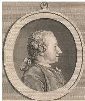
Fig. 2.1: Alexis Claude de Clairaut [1713-1765] [31]

As much of the following material will be on how this theorem transfers to other situations we give a detailed exposition of the proof.