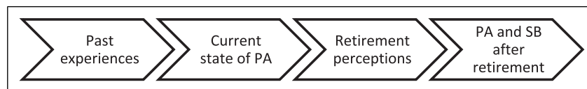
Figure 2. Story structure.

The development of these themes is presented in the supplementary file 4. Quotes from the interviews to support