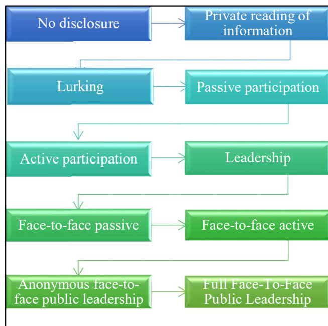
Figure 2. The Pathways Disclosure Model.

to a full face-to-face disclosure of events for the purpose of help seeking. This model is outlined in figure 2.