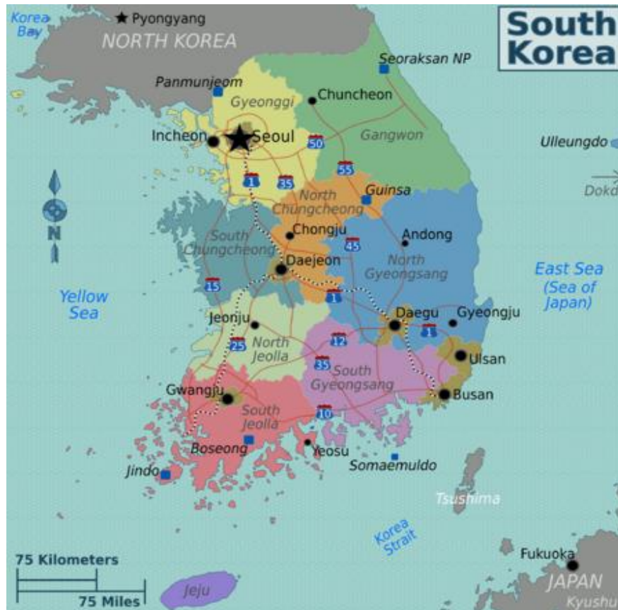
Figure 1. Administrative divisions of South Korea.

“cycle”) denotes container transport within this region. As a result, there are 856 arcs (considering container incoming and outgoing, each node is connected to 14 other nodes through roads and railways, and each node has a cycle. Thus, we have (14 \times 2 \times 2 + 1) \times 15 + 1 = 856 arcs in total) in total. However, for simplicity, we excluded arcs with volumes below a certain level in this case study.