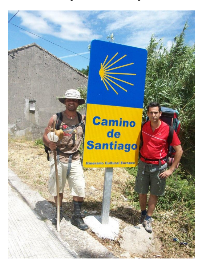
Figure 5. Symbolism. Use of the logo in the route signposts

On the contrary, symbols used as "logos" for the territorial marketing, or to promote commercial products, could provide a decrease of the enthusiasm of the pilgrims with a negative effect on their overall experience perception. On the other hand, this particular use of the symbols of Santiago contribute to strengthen the sense of safety of pilgrims, because it increases the perception of the existence of a well-structured and organized route (Figure 5).