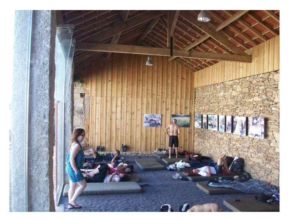
Figure 2. Albergue, S ão Pedro de Rates (Portugal)

In this regard, one of the most important result is the one related to the observation of the relation between the infrastructures for the pilgrims, in particular the albergues , where pilgrims use to spend their nights, and the level of perception of authenticity. The quality and the typologies of these infrastructures, as well as their policy of management, is not homogeneous along the way. It was observed—and then confirmed by the pilgrims' opinions collected through the interviews—that these differences indirectly produces among the pilgrims a different perception of the experience, that can be seen as "authentic" or "turistified". In these regard, an important detail is that also the representatives of the group of pilgrims motivated by reasons different from religion agreed with this idea. We can thus affirm that not only the pilgrims motivated by faith, but also those who experience the pilgrimage for recreation, are looking for a deeply authentic experience.