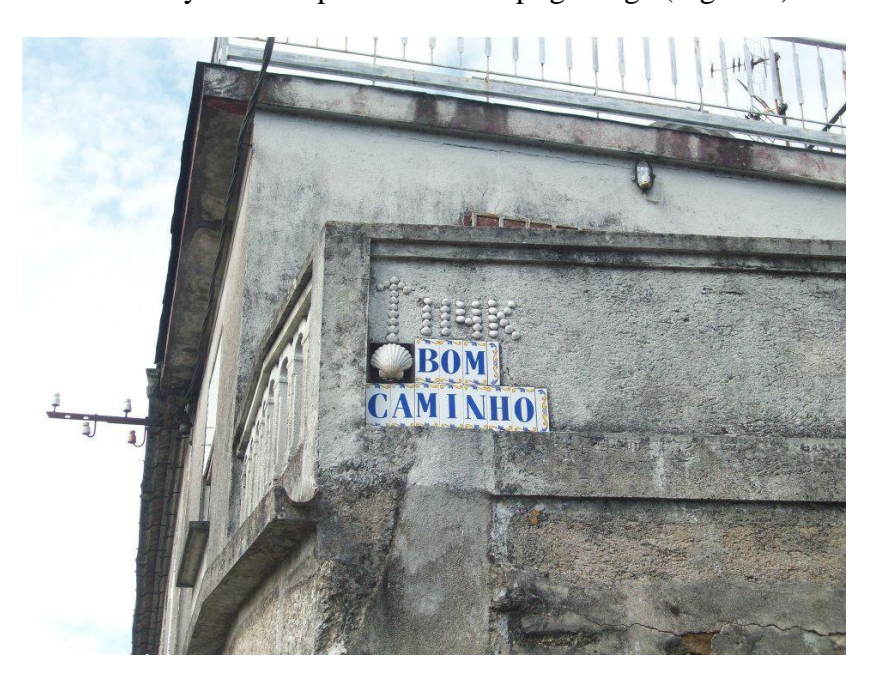
Figure 6. Private home decoration, spontaneously elaborated by local inhabitants on behalf of pilgrims

Finally, the local population shows a strong curiosity towards the pilgrims and their symbols. It is an important point that is not taking into account. The participation of the population represent an instrument to confer authenticity to the experience of the pilgrimage (Figure 6).