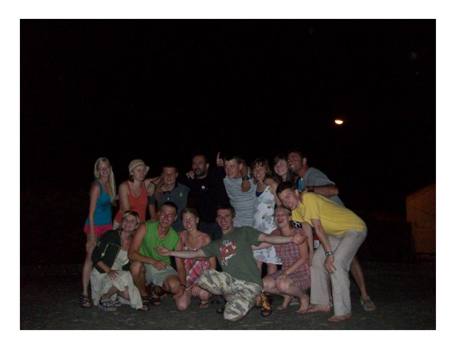
Figure 3. Activity in the Albergue of S ão Pedro de Rates (Portugal). Interculturalism is a very strong feature

In this sense, one of the most relevant observations was registered at the albergue of S ão Pedro de Rates. The young people responsible for the hostel had organized a meeting for the pilgrims to taste typical products. After the first minutes, pilgrims spontaneously transformed this activity into a culinary contest among them, and every group from a different country start to cook – the way they could - their traditional dishes. Activities like this are vehicle of intercultural dialogue that could and should be stimulated, even promoted, and repeated daily at the albergues . This consideration links this work to previous studies on tourism as a vehicle for intercultural dialogue, such as that related with tourism and the "Paideia Approach to cultural heritage management" [30] and more recently the one on Tourism and Cultural Heritage Quality Management [31]. Implication of this observation could be the stimulus, for example at the hostel for pilgrims to such activities of cultural exchange.