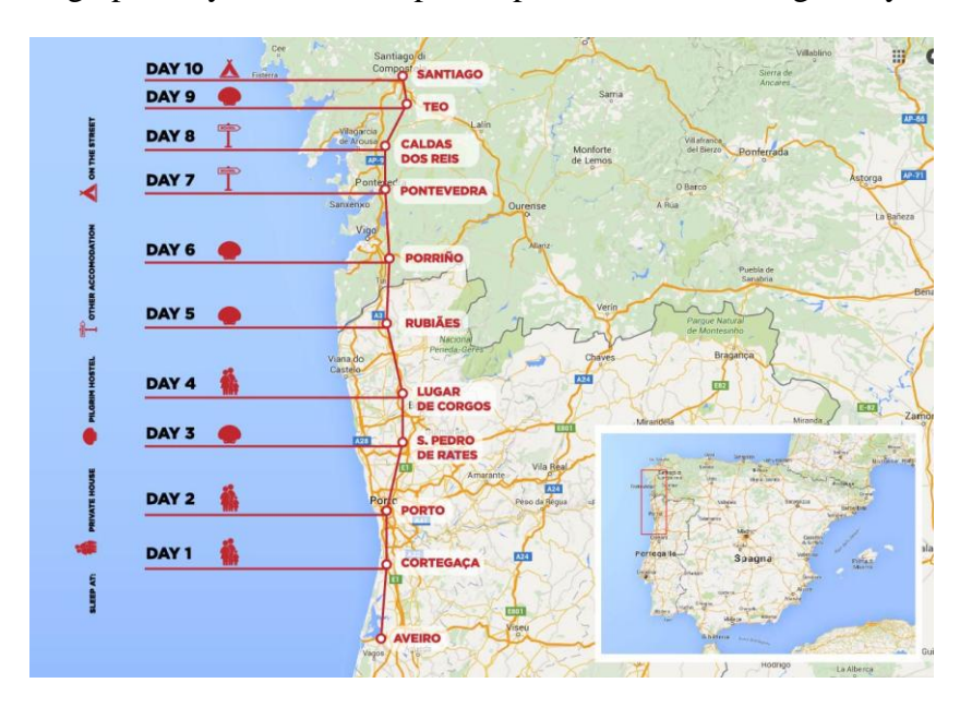
Figure 1. Itinerary and arrangements for overnight stays

The map shows graphically the route, stops and places where overnight stays have occurred.