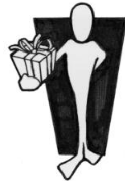
show don't tell