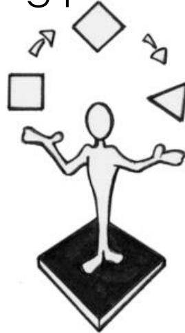
prototype toward a solution