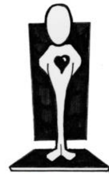
focus on human values

design thinking is a mindset to creating new and innovative ideas and solving problems (Turnali 2015).