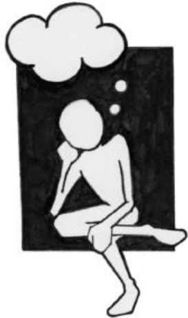
be mindful of process

design thinking is a mindset to creating new and innovative ideas and solving problems (Turnali 2015).