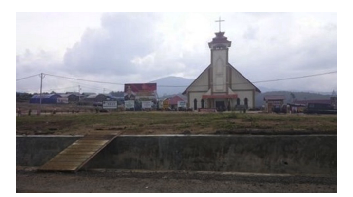
Fig. 9. New community buildings and houses in Siosar relocation village.

returned to their villages with no plans for relocation (Remaining), evacuation shelter inhabitants who will eventually relocate independently (Displaced), and permanently relocated people (Relocated). The last of the three groups had moved to a new settlement 27 km south of Mt. Sinabung called Siosar (see Fig. 3, Lokasi Relokasi). The relocation was assisted by the government and military; this category consists of villagers who were located at very close proximity to the crater within the 3 km exclusion zone (see Fig. 4). For the second displaced category, the government provided financial and bureaucratic aid to villages not initially living as close to the crater as the third relocated group (but closer than the remaining group) and organized temporary housing. These villages were not in any immediate danger during an eruption or in a hazard path (i.e., from pyroclastic flows and/or lahars), but they had been evacuated nevertheless and their occupants were not yet permitted to return. At the time of our study this displaced group still lived in evacuation shelters (also known as refugee camps) waiting for further instructions from the government, despite some having lived for five