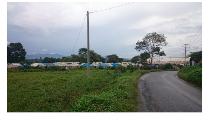
Fig. 5. Camp for displaced villagers.

affected by the difficulty in finding available accommodation and were supported by the government through rental assistance payments [59, 61]. Relocation of 370 households from the three abandoned villages in the Red Zone (see Fig. 4) to Siosar (located approximately 27 km south of the summit of Mount Sinabung) were completed late 2016 (see Figs. 8 and 9 for images and Fig. 10 for location).