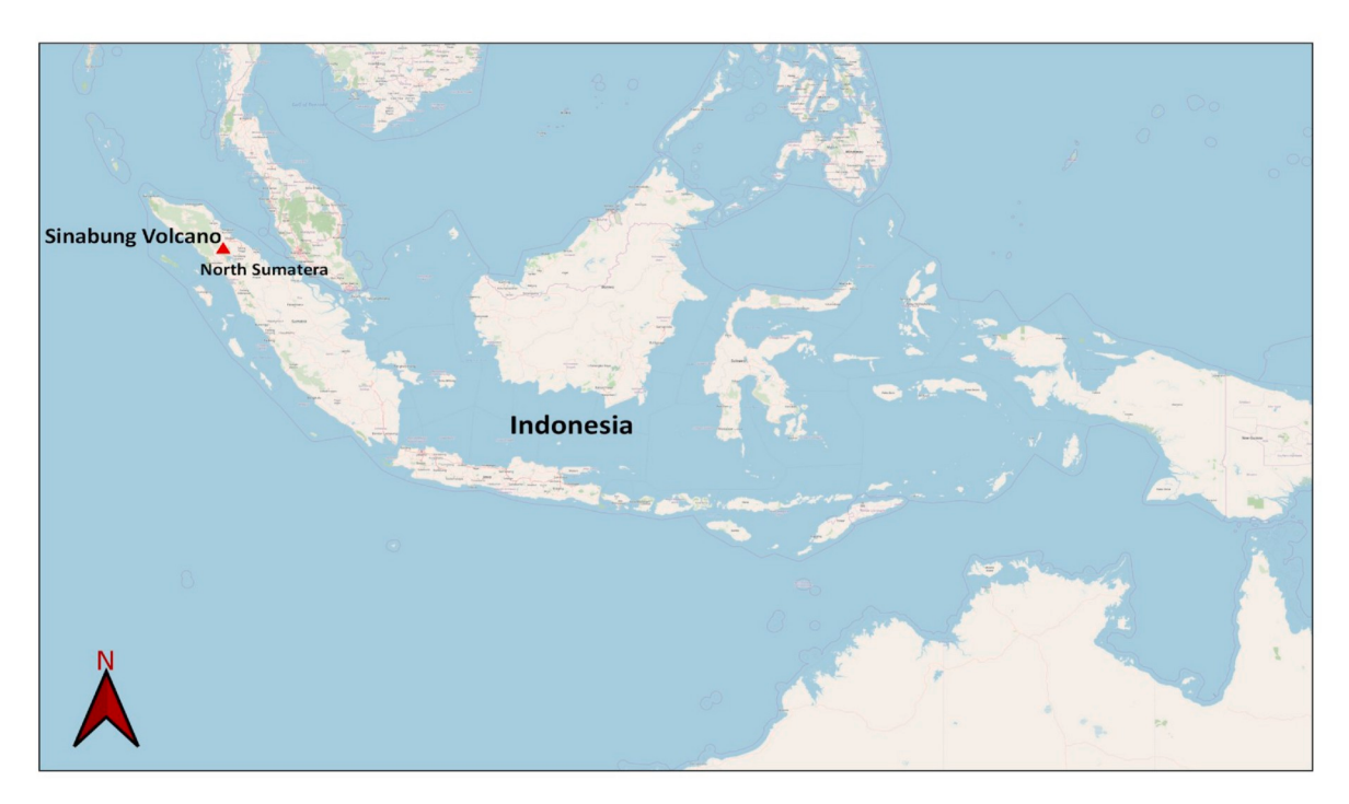
Fig. 1. Location of Mt. Sinabung in Sumatra, Indonesia.