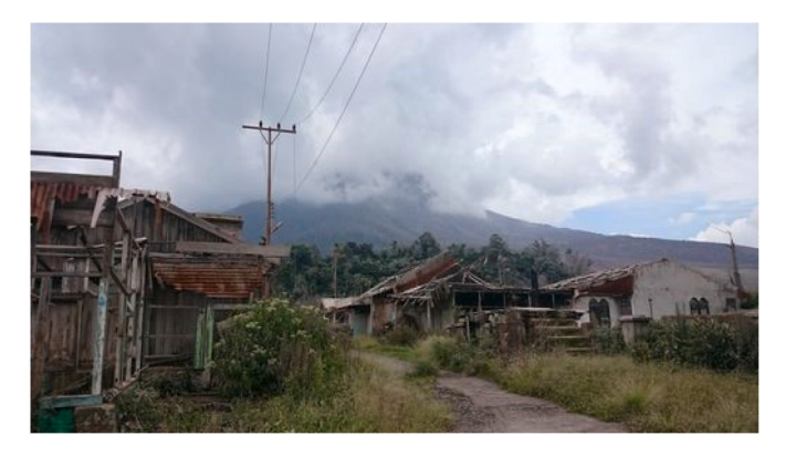
Fig. 4. Relocated village.