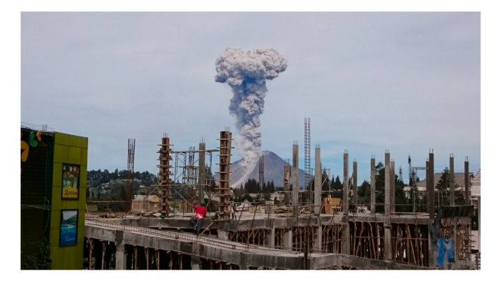
Fig. 3. Eruption of Mt. Sinabung viewed from Kabanjahe city.

International Journal of Disaster Risk Reduction 49 (2020) 101629