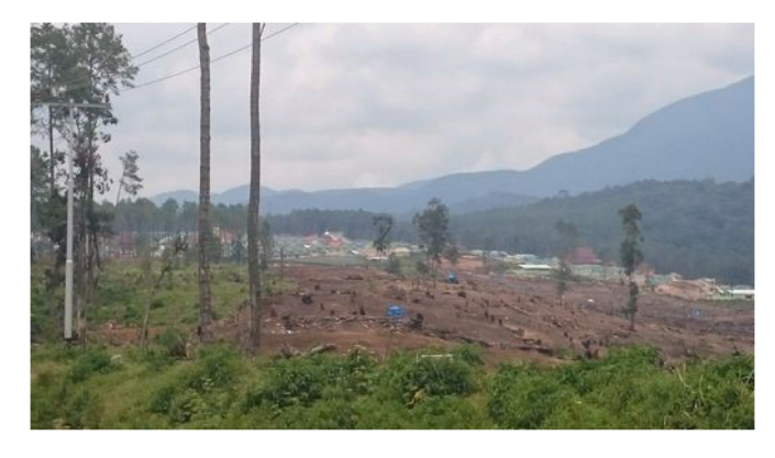
Fig. 8. Siosar relocation village and surrounding reclaimed pine forest.

A cross-sectional survey was undertaken from May 7th to May 17th, 2016. Participants completed pen and paper questionnaires distributed by a team of 11 researchers (see Acknowledgements). Participant Information Sheets and Informed Consent forms were provided to all