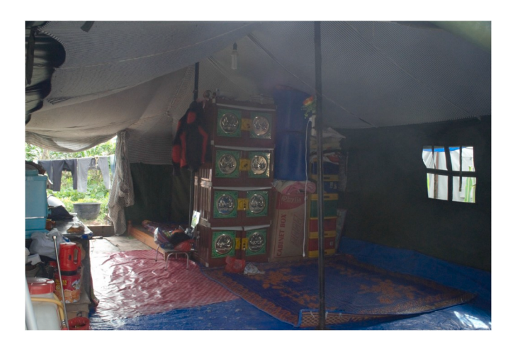
Fig. 7. Tent interior in displacement camp.