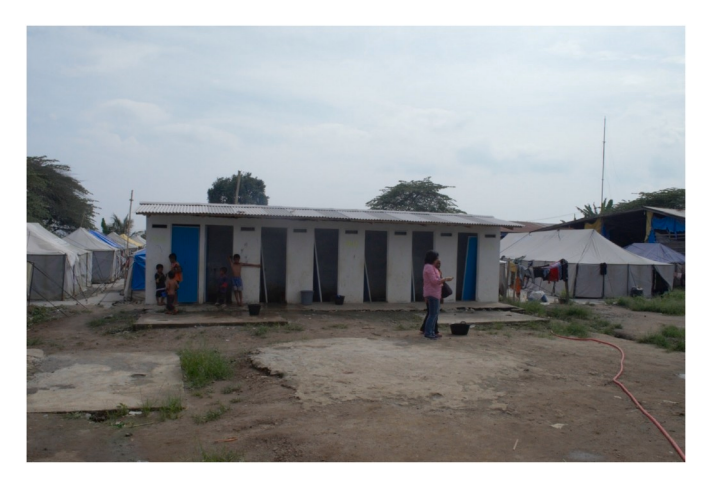
Fig. 6. Displacement camp facilities.