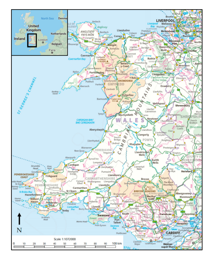
Figure 2. Map of Wales, showing relation to the UK.

We situate our analysis through a case study of the devolved nation of Wales in North-Western Europe (Figure 2). Wales is a predominantly rural country covering over 20,000 km<sup>2</sup> and is hilly and mountainous in many of its regions. In 2017, the population of Wales was 3.125 million people [67], which was around 5% of the total UK population [68]. The type of agriculture that has developed reflects this terrain and topography, as livestock farming, namely sheep and cattle, dominates much of the landscape. In 2018, Wales accounted for nearly a third of all UK sheep numbers (29%, 9.5 million) and 11% of UK cattle [69]. Beef and sheep farming incomes have been heavily reliant on funding from the CAP Basic Payment Scheme, particularly in upland Less Favoured Areas [70,71].