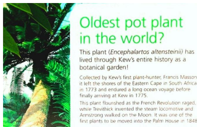
Figure 2. The oldest potted plant in the world is in the "living laboratory" of the Royal Botanical Gardens in Surrey (Kew Website)

The variety of chemicals produced and used to create a "protective" environment for the potted plants and support their artificial health such as pesticides and insecticides, fungicides, paints and sealants, anti-desiccants, disinfectants and sterilizers and deterrents (Beckett and et al, 1983). To keep them alive for a long period, it is necessary to keep them in laboratory conditions, and continuously re-pot them (Figure 2).