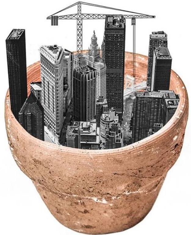
Figure 4. An Urban Area in A Pot, By Serap Sonmez (Sonmez, 2018)

Looking at the below image of a potted city and imagining the replantation of these structures in a forest resembles a violent action similar to agriculturalization of forest lands, or passing huge pipelines from the middle of forests or more similarly dumping construction wastes into forests.