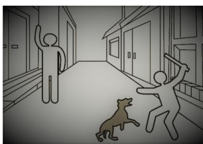
Figure 1. Man, Dog and Observer.

Figure 1 depicts the three characters involved in this scenario: man beating a dog, the dog and then observer (who is you). In practice, most people identify the dog and then themselves, as observers, as being the victims of trauma. Most do not speak of the man beating the dog as traumatised; until it is pointed out that, arguably, his own trauma is central to the creation of trauma of others. It is also likely to be deeper and thus more systemic than either the dog or the observer, either of whom, it might also be argued, might be more readily socially rehabilitated. This is partly because of the ignorance of, and reprehension towards, the socially aberrant behaviour expressed by the perpetrator of this violence [51]. Offered this latter reasoning, participants then seem suddenly aware of the critical relationship of the man’s violent behaviour to the experience of the others. Within this metaphor, in noticing that the body of the dog beater is difficult to access, he becomes unapproachable as the experience of violence appears to become ‘locked in’.