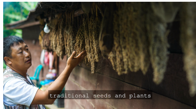
Video 1 – Farmers in Dzongu, Northern Sikkim, discuss the importance of traditional seeds, the challenges they face with the promotion of hybrid seeds and plans to develop a community seed bank, highlighting the ingenuity of farmers, indigenous peoples and communities

Thus, in many cases, the state’s organic policies are transforming spatial systems of production, moving in certain contexts from dense and diverse agroecological polycultures to organic monocultures, reflecting a substantial reorganization of landscapes and nature. Such an approach shares certain similarities