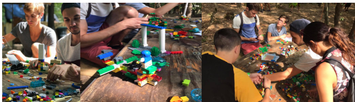
Figure 4. Participants of the Trial run of the playful LEGO session in Hungary

This part of the onboarding is to discover the reception of playful methodologies when engaging with real stakeholders within the farming environment. The playful LEGO session was delivered as a half-day workshop at the Gyüttment Farmers Festival in Hungary. The session was open and available to attend for all interested members of the public who attended the festival.