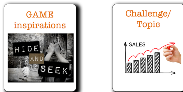
Figure 1. Example cards for the Remixing Play flash game (Arnab, 2019b)

Remixing Play consists of repurposing existing games or playful activities into new playful solutions. Figure 1 shows an example of a simple Remixing Play concept (the Flash Game version) that is used to nudge participants to rapidly and playfully construct a playful concept in a brief period. This agile and playful approach helps to nudge them to realise their ability, what they care about (motivation) using simple prompts and triggers, in this case, the two cards showing (1) game/play Inspirations and (2) Challenge/Topic. The "behaviour" that we are expecting to be nurtured is the sustained practice of playful and creative thinking – a "brain-worm" that will nudge participants to continually/automatically think about playful solutions for problems, needs, challenges and opportunities that you see in your day to day living (Arnab et al, 2019b).