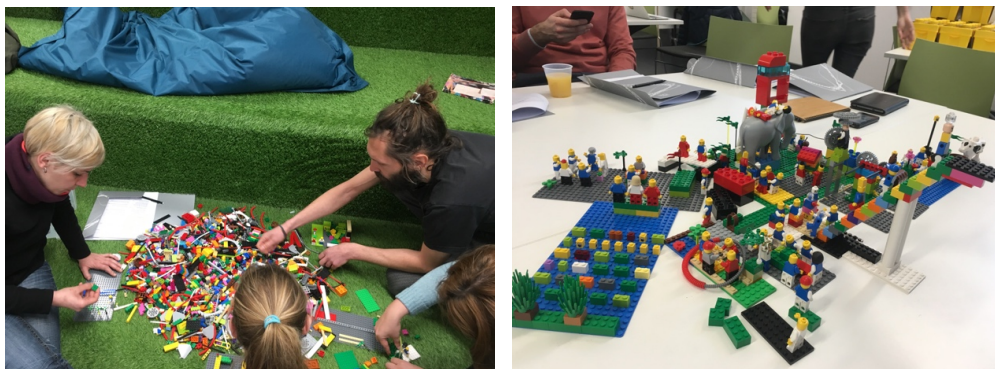
Figure 5. The LEGO Session with the Champions – from identification of challenges through to shared decisions

Nine 'Champions' were selected to represent the farming communities in the various countries in Europe to receive face-to-face training in Coventry University for both the playful LEGO and the Remixing Play approaches. The LEGO session facilitated the identification of context to the challenges in their sector, leading to a shared understanding of what the solutions could be. These insights were then used to inspire the Remixing Play activities, where the champions worked in teams to develop playful solutions to the challenges.