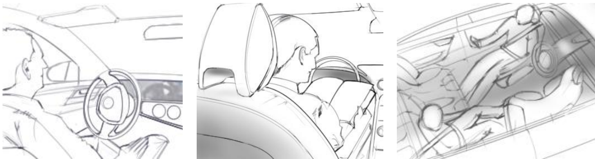
Figure 1. Illustration of the three main scenarios for automated vehicles: From active driver to passive supervisor / passenger (left); Engagement in non-driving tasks (middle); Rearward facing seating arrangements (right)

The argument we put forward in this paper is that these scenarios can be expected to significantly increase the likelihood of motion sickness in self-driving cars, or self-driving carsickness. Here, motion sickness refers to a condition in which people get sick due to motion. Although there is still debate about the actual origin thereof, the most widely accepted theory assumes motion sickness to be correlated with, and likely caused by, an error signal in the control of self-motion, like pain is correlated with heat when touching a stove, for example.