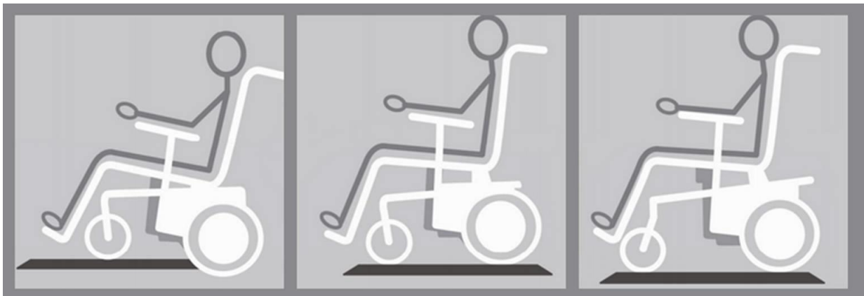
Figure 1. The WheelSense system in use ( note caster trailing arm position )

The resulting design concept is shown in Figure 1 below: