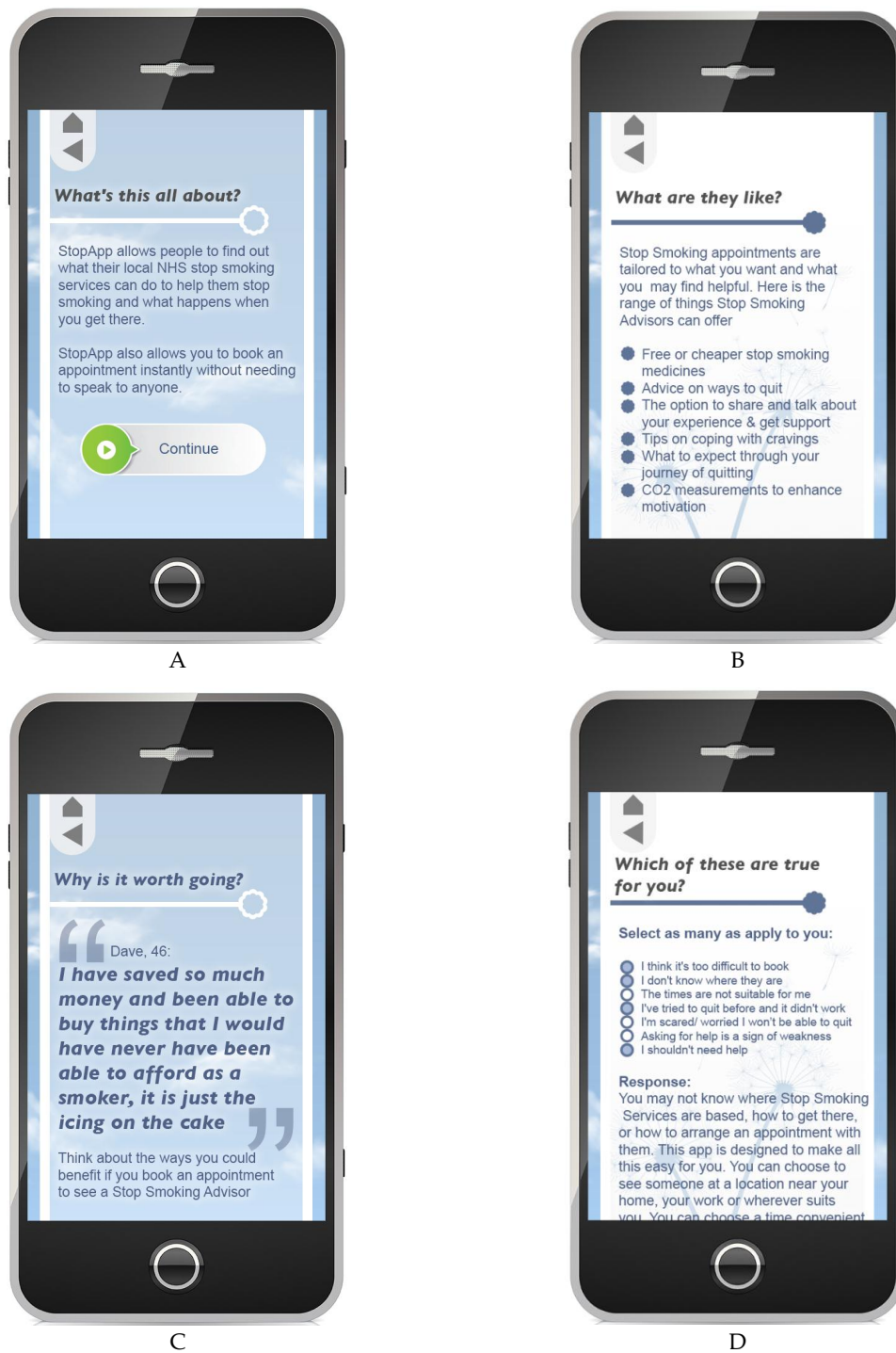
Figure 3. Screenshots from prototype app: (A) part of the introduction to the app; (B) information about the fact that SSS offer a range of approaches tailored to the user; (C) a genuine quote from an SSS user who successfully quit, with name and age; (D) screen that begins to provide tailored content for barriers relating to practical access to SSS and concerns about needing to access support to stop.

easily, and privately would act as a facilitator to access. They argued that this along with the behaviour change element of the intervention could facilitate people to capitalize on their own motivation, which is particularly important for people self-referring to the service, the main route to pharmacy-based SSS. They particularly liked the idea that the app will address what to expect at the service, what will happen , and what can be offered .