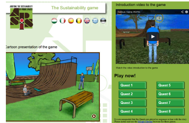
Figure 1. The Sustainability game structured into 8 quests implemented as mini games

improve urban design. The mobile version is available on android devices and it resembles the same features and mission as the web-based version.