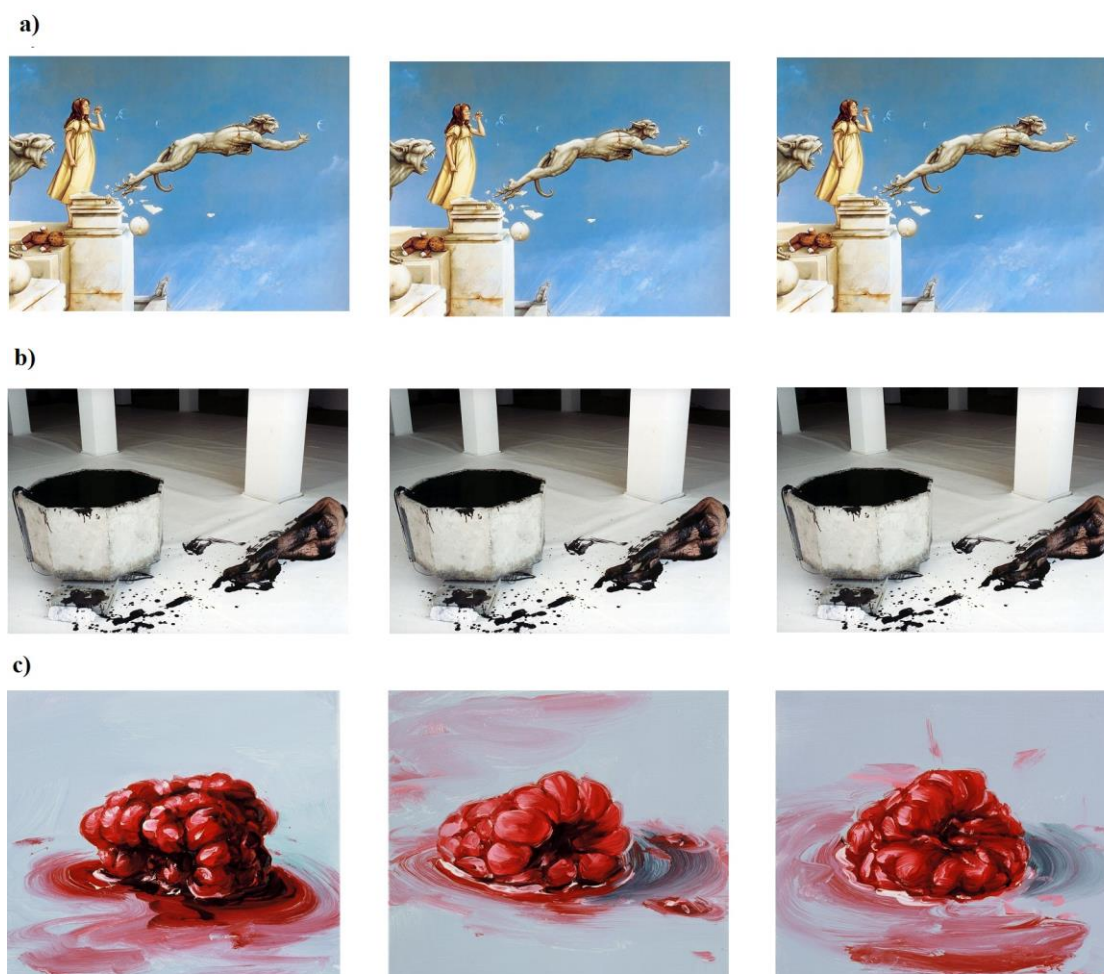
Figure 1. Examples of stimuli for a) positive identical: “Magic Realism” ©Michael Parkes. b) negative identical: Monika Weiss “Elytron” 2003, self-shot photography, performance, installation, sculpture and video. Courtesy the artist and Chelsea Art Museum, New York and c) different: Cornelius Voelker “Raspberry”, 2008, oil on canvas, 11.8 x 13.8 inch (© VG Bild-Kunst).

63,60, p = .001 , \eta^2=0.927 ). Paired sample t-tests showed that images in the negative identical condition were rated as significantly more negative than images in the positive identical condition ( t(7) = 33.73 , p = .001 ), and images in the different condition significantly less positive than images in the positive identical condition ( t(5) = 5.87 , p = .002 ) and less negative than images in the negative identical condition ( t(5) = 4.52 , p = .006 ). The different condition was included to assess if the CSE would only be present in identical images or if it would also occur if the images were slightly different. This design allowed a comparison between decision-making that is based on a combination of heuristics and image differences.