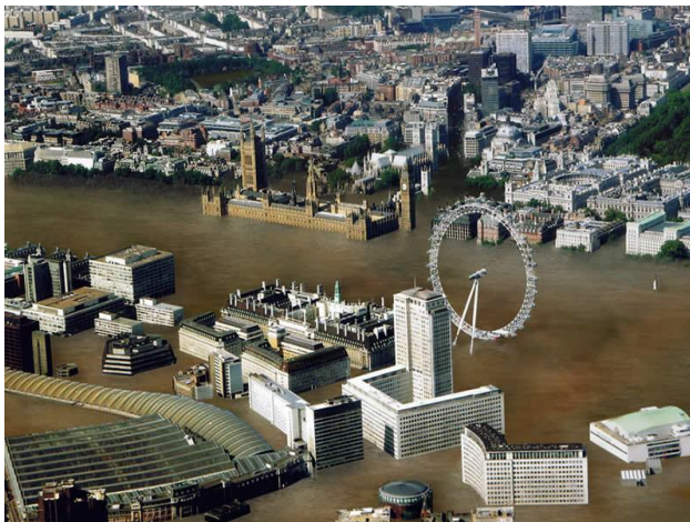
Figure 3 A simulation of floods in London's Westminster

At the end of the simulation, players are asked their demographic information (location, age range, and gender) and are invited to answer a few questions regarding their experience with FloodSim, and may leave general comments which require an email address. The feedback section was organized in 5 areas for the player to comment on relating to issues to Flood Policy. FloodSim was released in 2008 following the devastating floods that were experienced in the UK in 2007. It was advertised through various websites and magazines, and could be accessed freely from PlayGen's website.