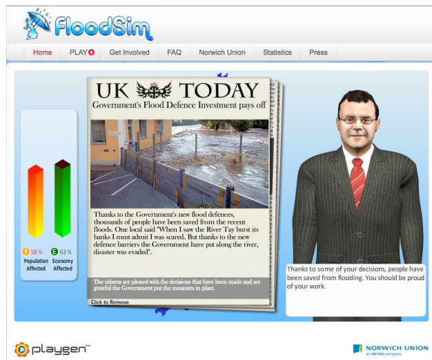
Figure 2 Feedback provided by FloodSim

Level of Protection, Current Population, Flood Risk. If strategies are not well considered the consequences could be flooding of cities, such as London (Figures 3 and 4) or Liverpool (Figure 5).