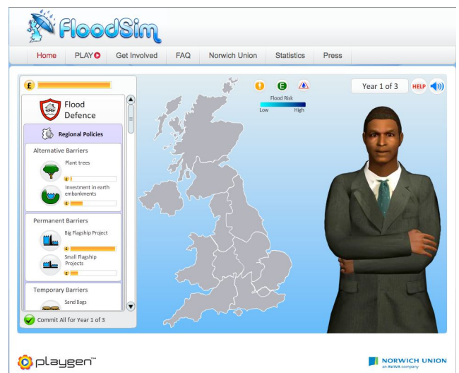
Figure 1 FloodSim's interface

FloodSim is a simulation developed by PlayGen Ltd 1 and commissioned by Norwich Union 2 . The objectives of the simulation are: to 'help raise awareness of the flooding issue surrounding flood policy and Government expenditure and to increase citizen engagement through an accessible simulation'. FloodSim allows the player to take on the role of flood policy strategist employed to implement a selection of strategies for addressing the risk of flooding over the course of 3 years based on a pre-defined budget, see Figure 1. A brief comment on the advantages and drawbacks of each option is presented when the mouse is rolled over each icon. The player selects each strategy by dragging the icon over a region of the UK.