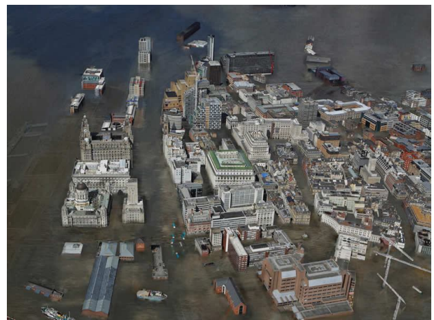
Figure 5 A simulation of floods in Liverpool