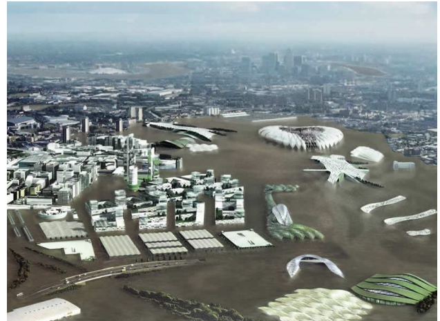
Figure 4 A simulation of floods in London's Olympic site

To throw some light onto FloodSim's societal impact in raising awareness about flood policies and citizen engagement, the data collected during the first 4 weeks was analyzed. These analyses were undertaken during November 2008. The purpose of these analyses was to assess the extent FloodSim raised awareness of the risk of flooding and what players thought could be done in terms of flood prevention.