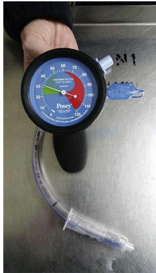
Figure 3 Test with ETT: manometer.