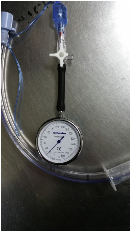
Figure 2 Test with ETT: improved device.

The device is neither expensive nor difficult to construct. The consumable components (syringe and stopcock) could be replaced to prevent cross contamination.