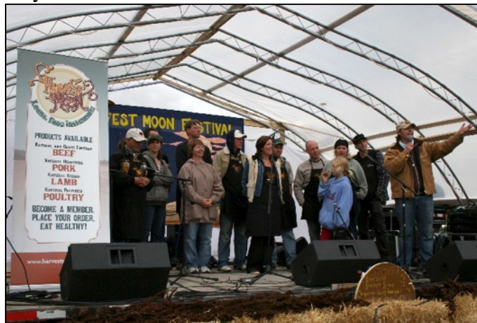
Video 1 - Launch of the Harvest Moon Local Food Initiative at the fall music and rural culture festival in 2008. http://www.dailymotion.com/video/x8uv5e_harvest-moon-local-food-initiative_people

plan, we considered the experiences and ideas of HMLFI farmers with models and concepts from the academic literature on food hubs, solidarity purchasing groups, alternative food networks and research on similar groups. The HMLFI model focuses now on