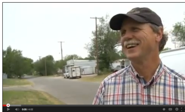
Video 3 - Oklahoma Food Cooperative.

The third cycle of inquiry involved a series of case studies documenting other “civic food networks” across Western Canada and the USA to inform the development of the HMLFI. As a part of this process we drew from the academic, grey and web-based literature to examine different dimensions and case studies of food hubs, buying clubs, and local food initiatives especially to inform the development of the second iteration of the HMLFI. From this review, we examined the successes, challenges, strategies, and concepts employed in other regions in relation to our own experiences and values to inform the next phase of development. Our PAR team visited Oklahoma Food Co-op – the longest standing on-line local food cooperative in North America – to learn from their experience and to exchange ideas. This horizontal exchange proved far more valuable learning than any support offered by expert business development specialists, and provided first-hand insight into new technical and social innovations used in Oklahoma. Our PAR team