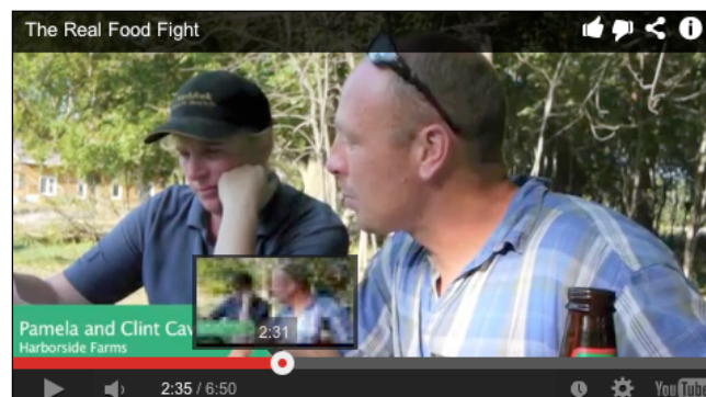
Video 4 - The Real Manitoba Food Fight. http://www.youtube.com/watch?v=H1F6sCPMlm8

The Real Manitoba Food Fight was launched on August 31, 2013, with the publication of an interactive website www.realmanitobafoodfight.ca . Over the course of six months, the website had 9,180 unique visitors and was used to aggregate related