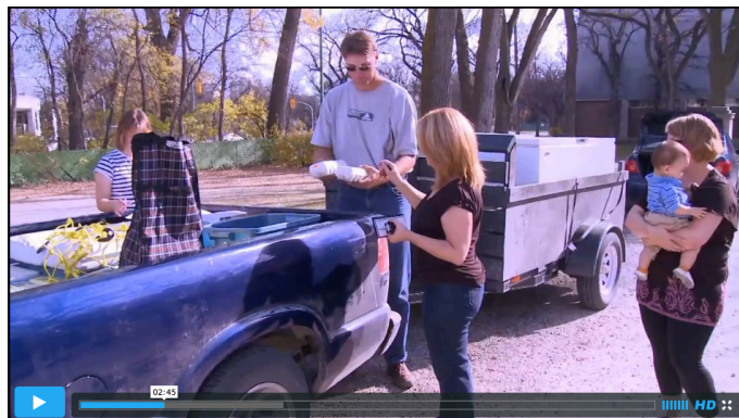
Video 2 - Harvest Moon Local Food Initiative video. https://vimeo.com/24041463