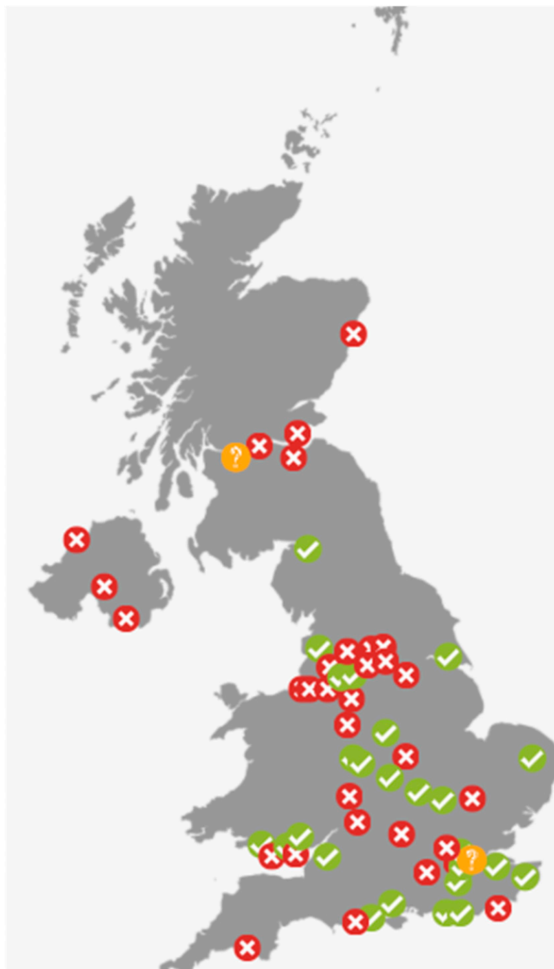
Figure 1. Overview of access to supervised exercise programmes (tick = access, cross = no access and question mark = don't know).