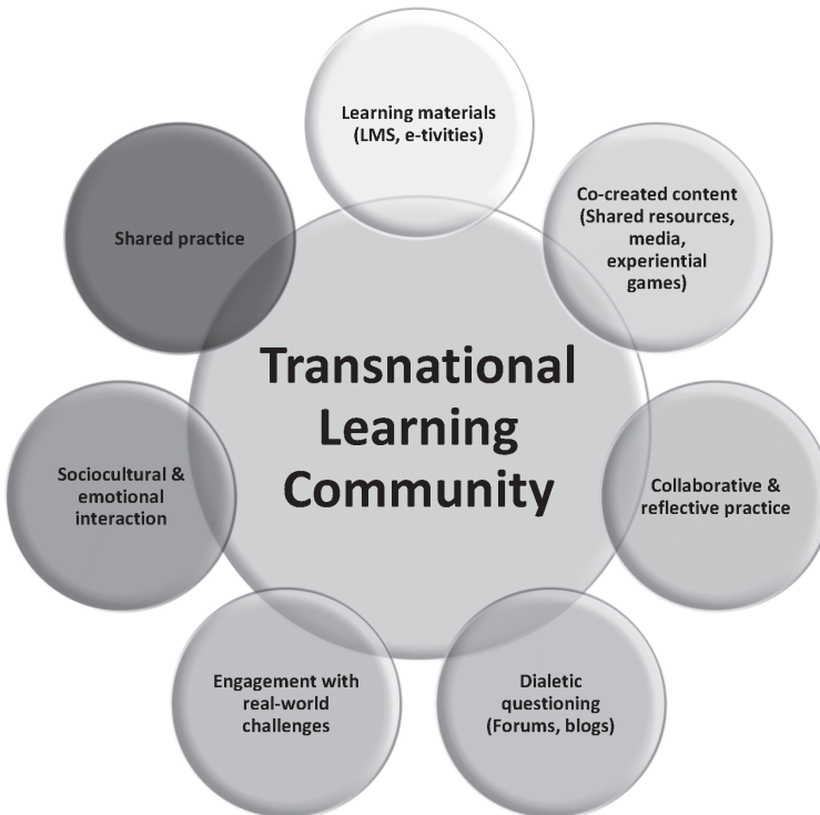
Essential Tools and Principles for EcoCOIL