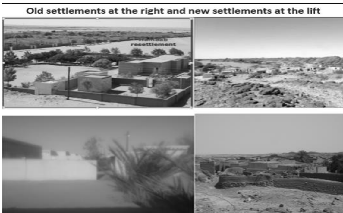
Figure 2. Images of new settlement and old settlement: Source: Author.

These opinions about the new settlement are supported by many respondents who challenge the critics of dam resettlement, such as Scudder (2012) and Jackson and Sleigh (2000). Singh’s study of 50 large dam resettlements in five continents (1997) acknowledged that living standards in resettlement areas have improved slightly and livelihoods have been restored to some degree. The Sudanese government’s misrepresentation of the Merowe Dam resettlement through its control of the media portraying the substantial facilities of the new houses, land, services, and financial compensation misled the Sudanese public and encouraged a dialogue that was critical of the Manasir, and others affected who protest or show dissatisfaction with resettlement.