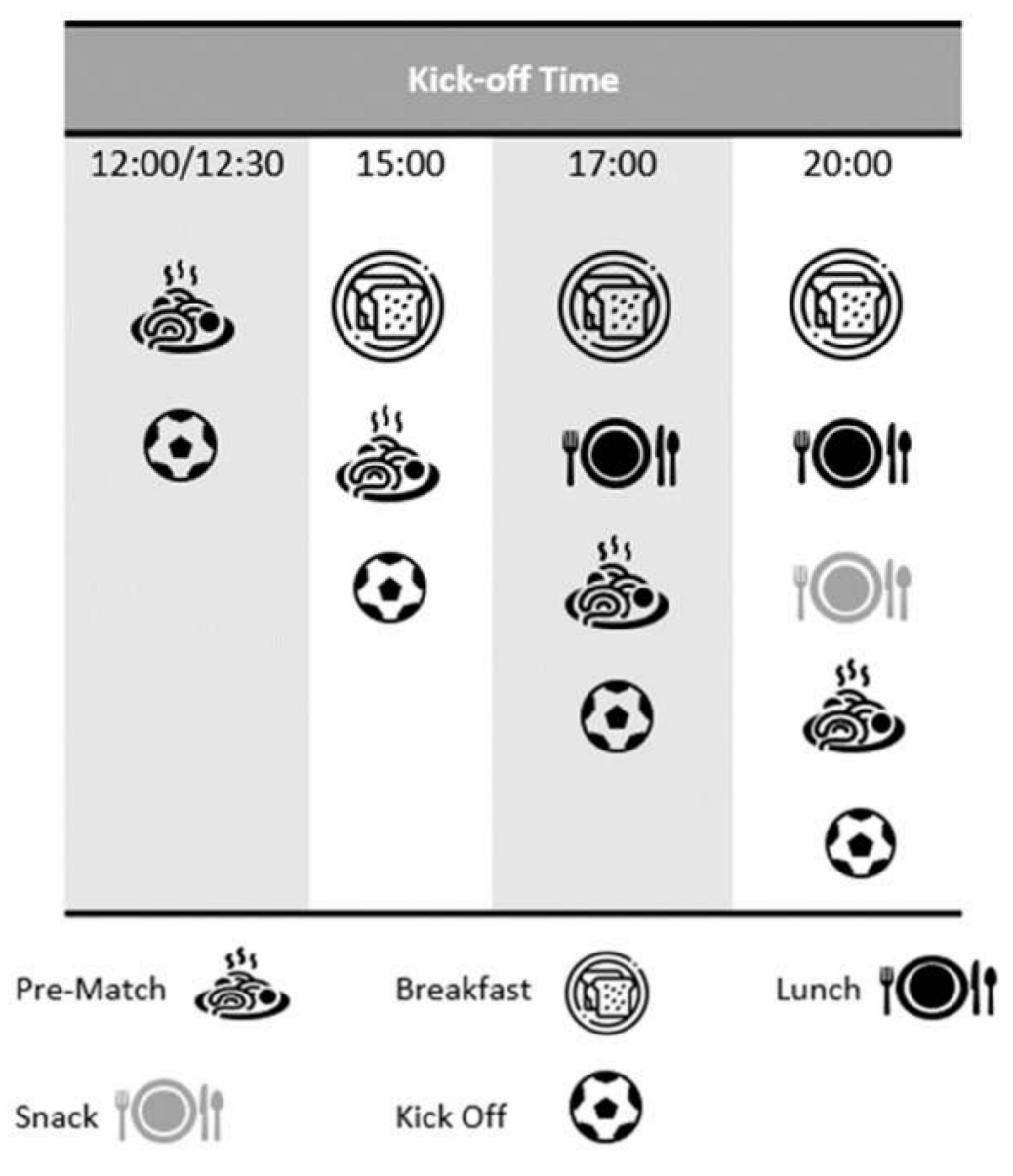
Figure 1. Pre match feeding strategies based on kick-off times.

An issue over the last number of years is that kick off time varies considerably in elite soccer matches (mainly due to the demands of television). Start times may be as early as 12:00 or 12:30 and as late as 20:00, although most matches in the UK have a 15:00 kick off time. Clearly early kick off times imply a single feed strategy whereas for a 15:00 start there is the possibility of a two-feed strategy, and for a 20:00 kick off a three-feed strategy is desirable. For the earlier start times the importance of a sufficient CHO intake during MD-1 is paramount, whilst marginally less so for evening matches. Figure 1 highlights the possible scenarios for match day feeding strategies based on variations in start times.