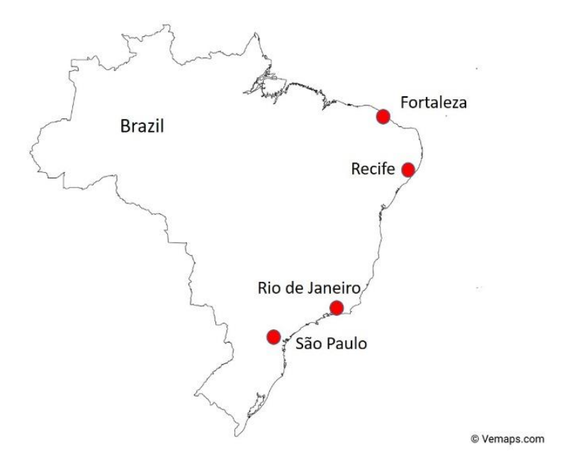
Figure 1. Location of the highest incidences of ZIKV and microcephaly cases in Brazil (Brazil Map by Vemaps.com, accessed on 20 January 2022).

Favela is generally used to identify an informal settlement in the Brazilian context; thus this will be used hereinafter.