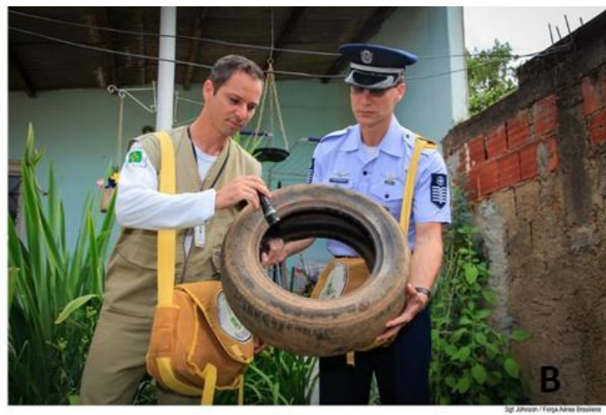
Figure 6. The Brazilian Air Force assisting in an exercise "all against Zika" in the local community, checking tyres containing water. ( A ) "Todos contra o Zika" by Força Aérea Brasileira—Página Oficial is licenced under CC BY-NC-SA 2.0. ( B ) "FAB participa de ação de combate aos criadouros de mosquitos" (Brazilian Air Force (FAB) participates in actions against mosquito breeding sites) by Força Aérea Brasileira—Página Oficial is licenced under CC BY-NC-SA 2.0.

Participants, including both favela residents and the academic community, felt that the information that was in circulation was misleading or ambiguous, in particular about the ZIKV and also the breeding habits of the Aedes aegypti mosquito, stating that for instance: