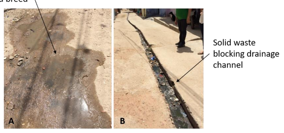
Figure 4. ( A , B ) Blocked and inadequate drainage, with mosquito larvae in standing water outside dwellings in favelas, Fortaleza, Brazil.

Standing water where mosquitoes could breed \(\cap \)