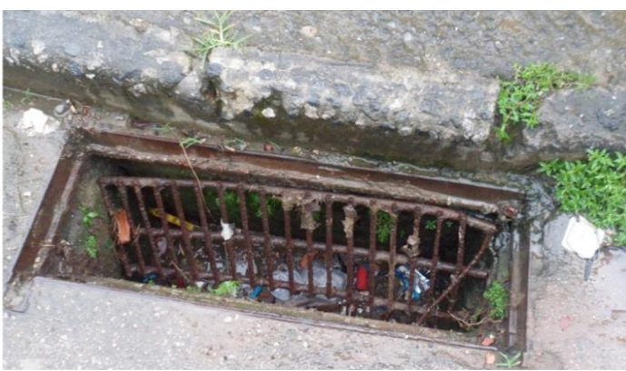
Inefficient gulley resulting in standing water at the roadside