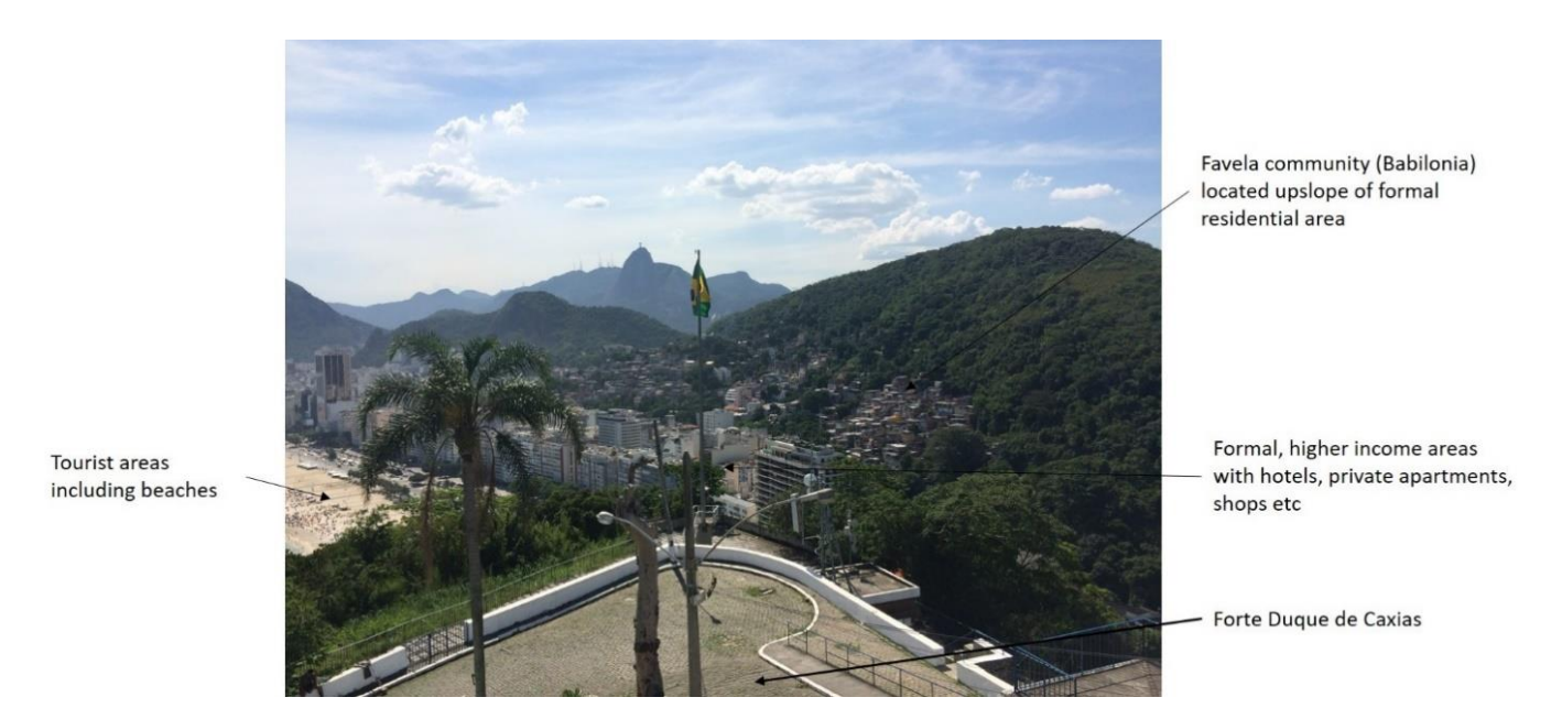
Figure 7. Location of some of Rio de Janeiro favelas.