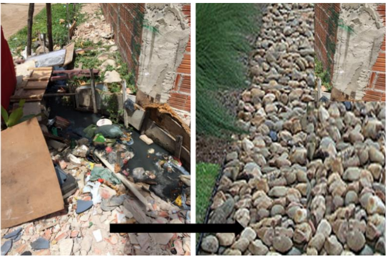
B. Installing stonefilled trenches allows water to infiltrate underground, denying access to mosquitoes and hence prevent breeding.

A. Rubbish-strewn building curtilage, encouraging the accumulation of polluted standing water. Mosquitoes can breed in these stagnant pools.