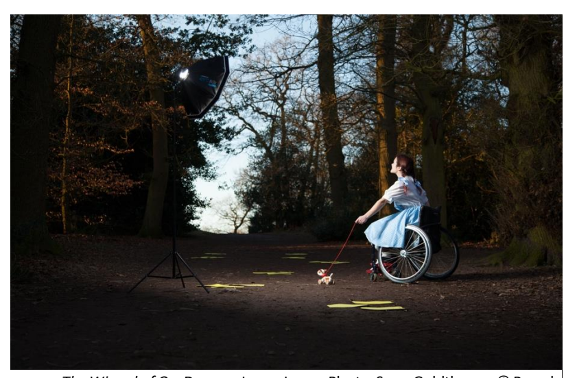
The Wizard of Oz. Dancer: Laura Jones.

The 11MRTD project was an intervention that explored the intersection between dance and disability. It is important to consider the relevance of the RE prefix not only within a dance context but also within disability discourse. With RE meaning either back or again<sup>3</sup>,