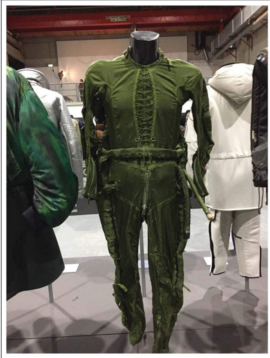
Figure 6. Chinese Fighter Pilot's Anti-G Suit (exhibited at Invisible Men at Westminster Menswear Archive).

object in question was a green one-piece garment (see Figure 6), which I initially took to be a piece of avant-garde fashion or some kind of hypermodern streetwear. The polyester and nylon mix forest green onesie displayed many of the key design traits of a garment which drew heavily on punk styling. A laced décolletage hinted at the constraints of corseting