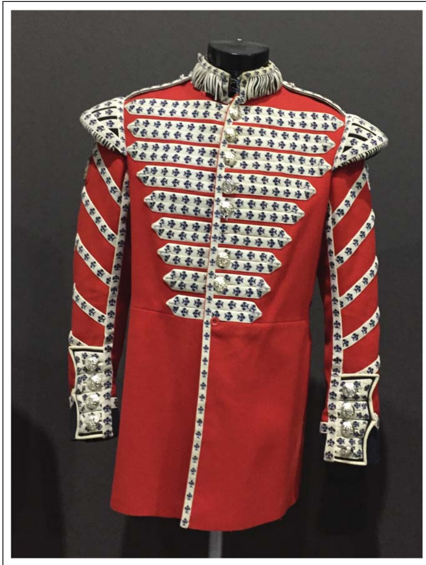
Figure 3. Grenadier Guard's Drummer Tunic (exhibited at Invisible Men at Westminster Menswear Archive).

2016; see also Craik, 2003; Ugolini, 2010). There is an element here of belonging, whether this is to a particular group, regiment, country or ideal. Furthermore, de-individualisation is an intrinsic part of the purpose of military uniform, to encourage soldiers to act as a single unit and disavow self-preservation, or align oneself with a