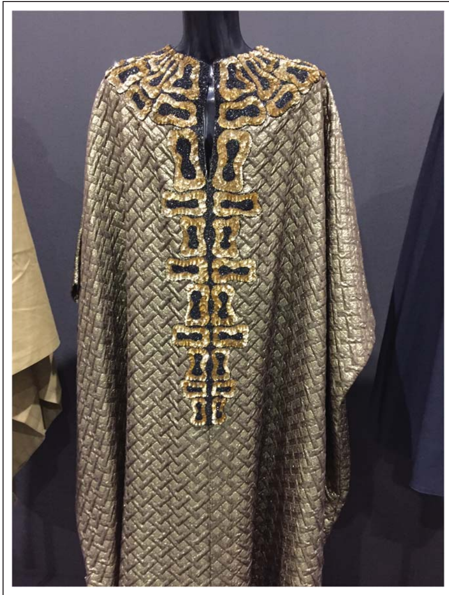
Figure 1. Gold Lamé Kaftan by Mr Fish (exhibited at Invisible Men at Westminster Menswear Archive).

scholarship on dress is concerned with both women and the non-west (see Luvaas and Eicher, 2019). Indeed, even when men are the focus of anthropological interest as in the case of Friedman (1994) the geographical focus tends towards the exotic. The term exotic is carefully chosen here, and specifically anthropological, conveying a sense of