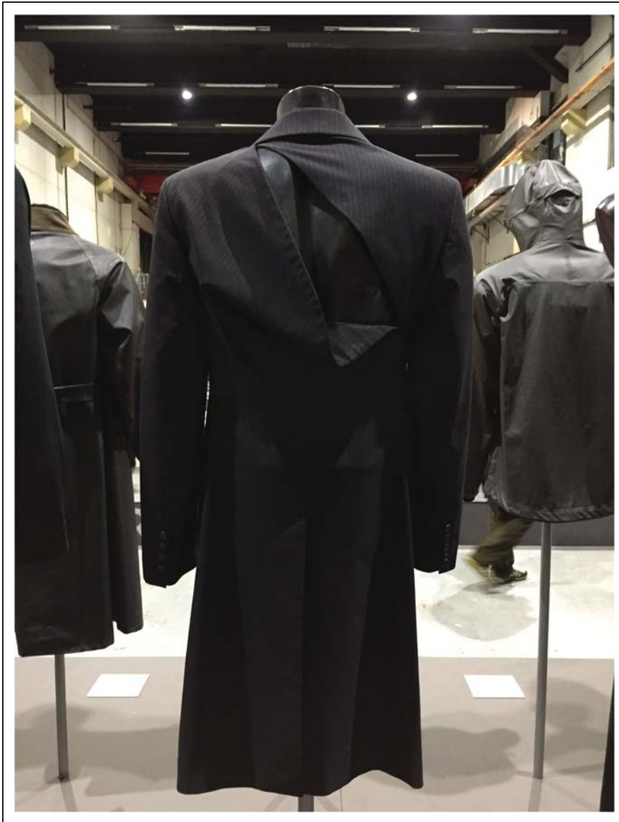
Figure 8. Black Coat with Slashed Back by Alexander McQueen (exhibited at Invisible Men at Westminster Menswear Archive).

single breasted with neat lapels in a fine wool fabric with a faint grey chalk stripe, but it was the back of the coat that was special. The mannequin wearing this black coat had its back to the gallery, displaying a beautifully tailored slash, across the rear of the coat, as though McQueen had simply lashed out with a razor blade. Yet there was no raw edge,