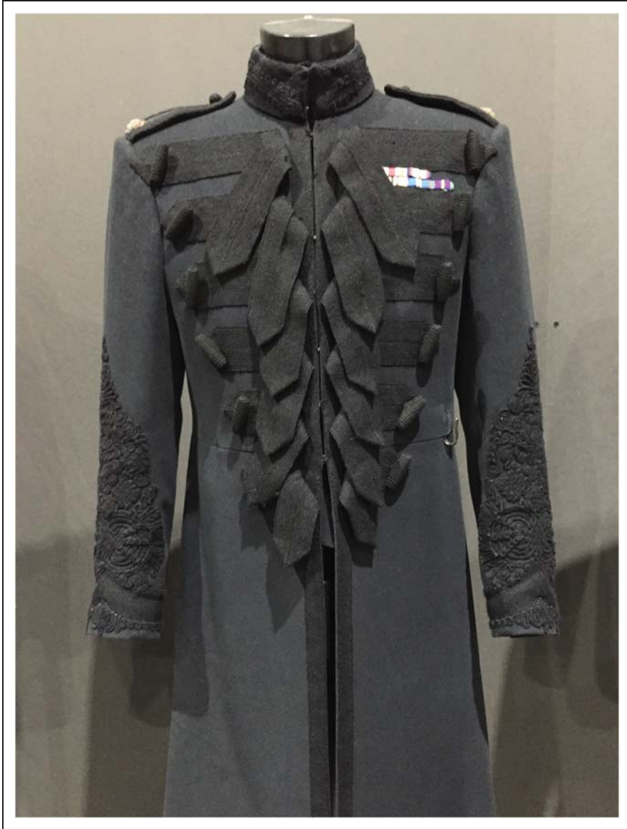
Figure 4. Life Guards Officer's Mess Uniform (exhibited at Invisible Men at Westminster Menswear Archive).

partisan group. However, uniform has also come to be a much-established comedic trope within the long established heritage of British comedy. Sitcoms such as Dads Army and The Thin Blue Line use military and police uniforms respectively to gently subvert the ideas that these garments represent, highlighting the juxtaposition between the conceptual