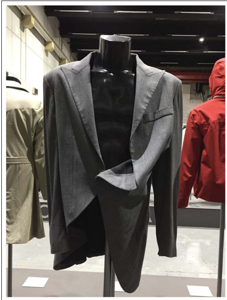
Figure 7. Grey tailcoat by Alexander McQueen (exhibited at Invisible Men at Westminster Menswear Archive).

with infinitely more exquisite tailored finesse. Other pieces included a tailcoat with more fabric to one side of the front than the other giving a graceful draped effect, which should not have worked yet somehow did (see Figure 7), and then in the centre of this collection an astonishing black coat (see Figure 8). From the front this black coat was quite ordinary,