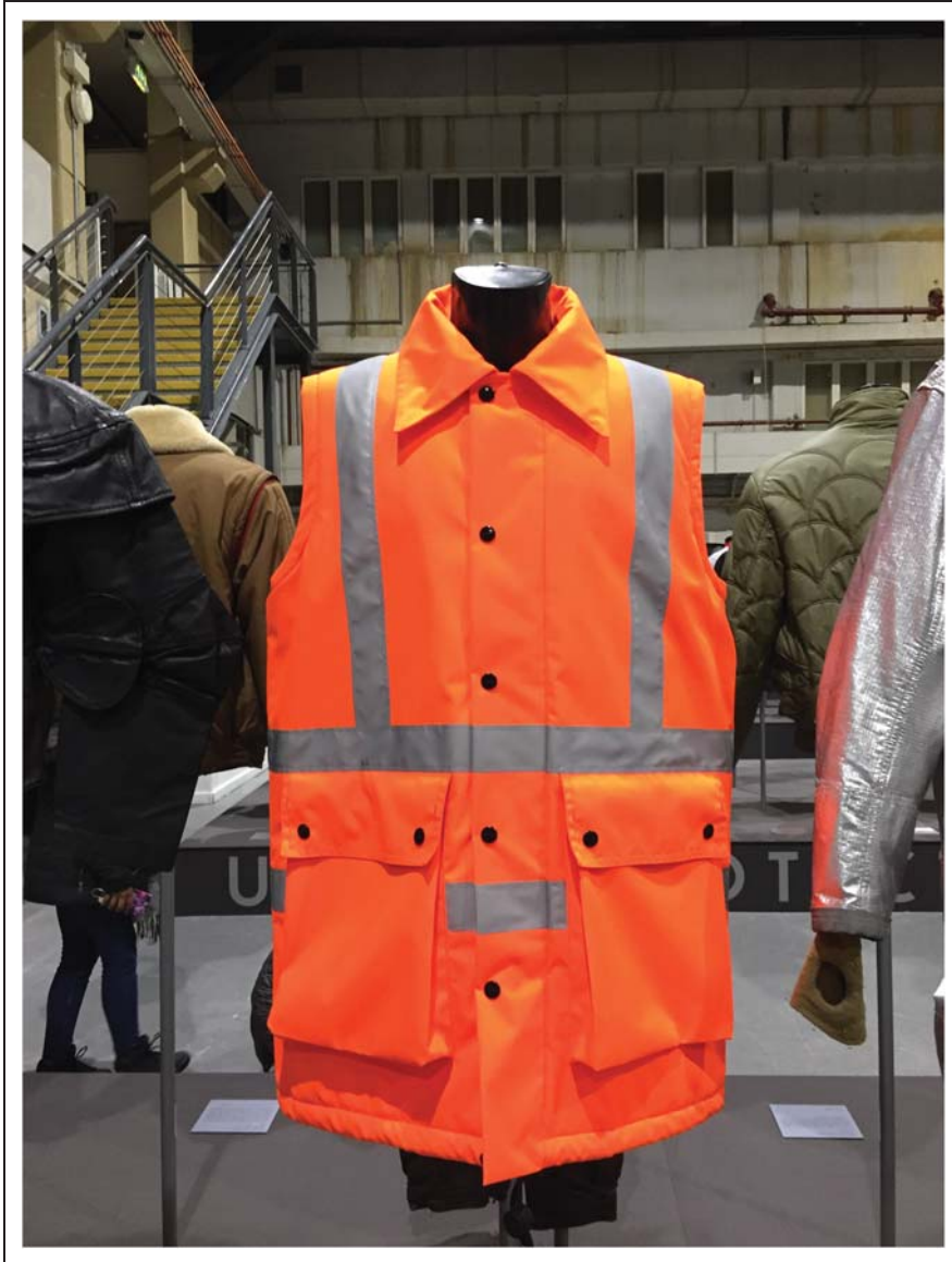
Figure 5. Hi-Vis Orange Vest by Burberry (exhibited at Invisible Men at Westminster Menswear Archive).

as while the garment is removed from use and held in a sterile inertia – somehow temporarily detached from the typical life of such a garment – this atypical existence is rarefied and signals that the garment has been ordained as special and worthy of this treatment. Yet we could still question which way this gaze is falling, are they looking