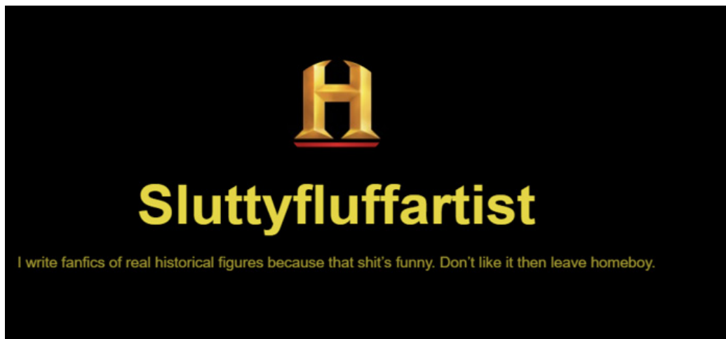
Figure 2. sluttyfluffartist header.