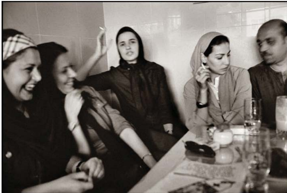
Figure 3. Tehran Café, photograph taken by Abbas Attar (2001).