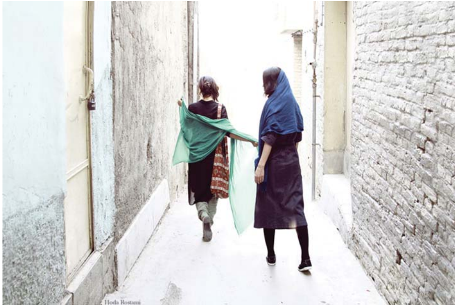
Figure 1. 'Hidden City' (2014).

contradictory to the western context. In her book, The Death and Life of Great American Cities , published in 1961, Jane Jacob advocates 'neighbourliness' as a kind of DNA of street life, arguing that 'local control' or 'the eyes on the street' in West Village New York creates safe streets. In the context of Tehran, however, and in the small-scale traditional neighbourhoods where most people are known by others, local control and the eyes on the street of neighbours and family members remove 'the space of anonymity' and 'freedom' by controlling and judging every movement of women and youth (Amir-Ebrahimi 2006, 4).