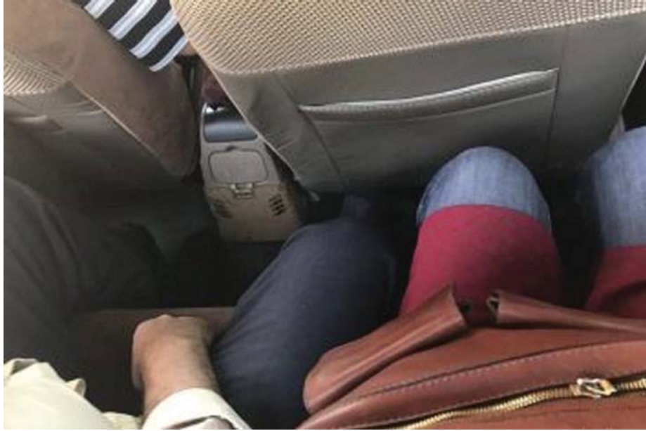
Figure 4. Men's bodily gestures in shared taxi, photo from state news agency Etemadeno.ir (2017).