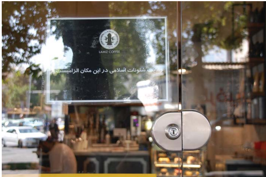
Figure 2. Observing Islamic Hijab IS Mandatory in This Place'.