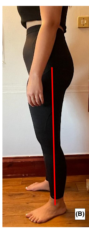
FIGURE 1 Lateral view photograph of case study patient posture. No dynamic fabric orthosis (A) and with dynamic fabric orthosis (B). Red line is drawn from midpoint of the lateral tip of greater trochanter to the midpoint of the lateral malleolus