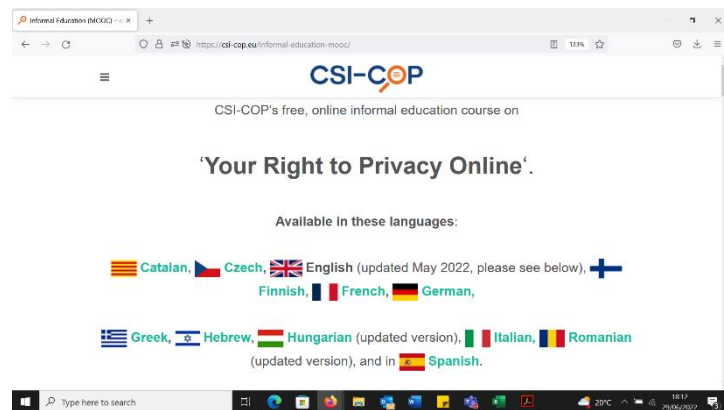
Figure 3: CSI-COP MOOC language availability.

Despite COVID-19 affecting CSI-COP efforts across 2021 and into 2022, as a result of the virus evolving leading to variants of greater transmissibility, the partners recruitment and engagement activities have reached thousands through communication, dissemination and exploitation actions.