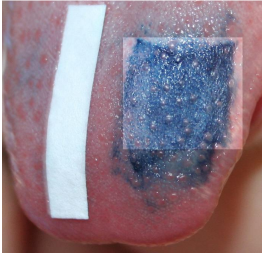
Fig 1. Example photograph with image adjustments to ease analysis.